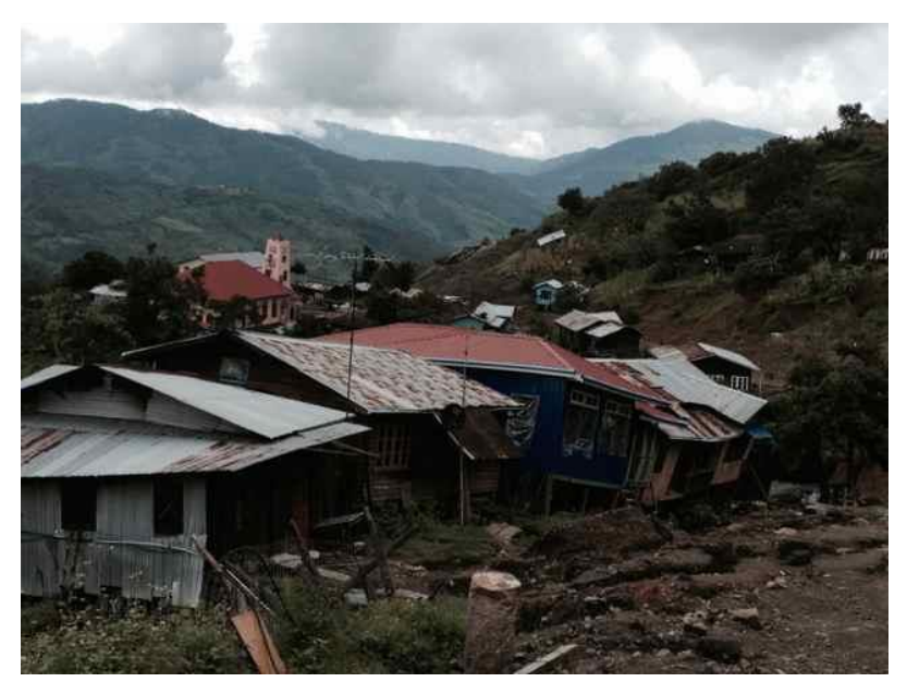
Destroyed houses, S Barton Hakha, 10/09/15