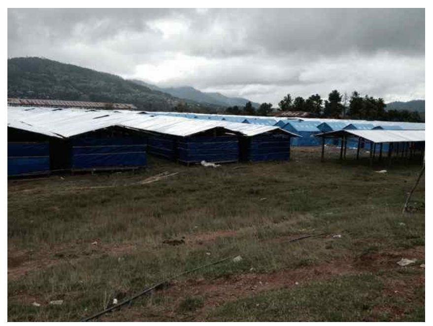
Long houses and tents for longer term accommodation S Barton Hakha 10/9/15