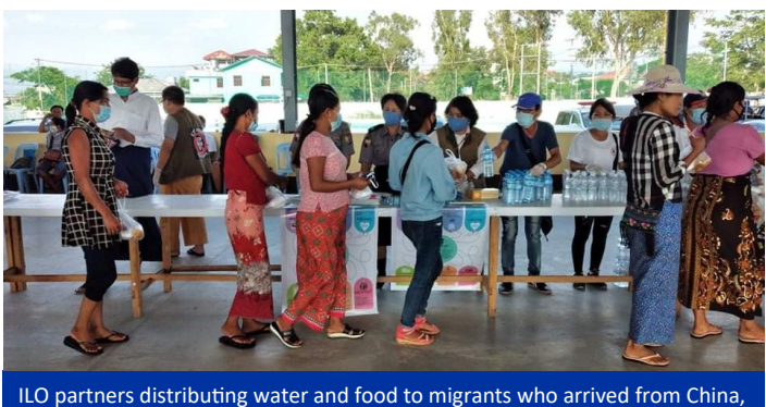
ILO partners distributing water and food to migrants who arrived from China in Keng Tung, Shan State.

Returns from China continue, with a total of 21,291 returns from 16 April to 21 May , according to data from the Department of Labour (DOL). The major entry points were in Kachin and Shan states, with most returns from China in May occurring through Nan Taw, Chin Shwe Haw and Mongla border crossings in Shan State.