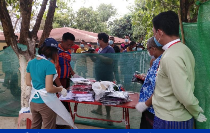
IOM staff and Migrant Resource Centre Counsellor distributing assistance to returning migrants at Kyauk Lone Gyi Quarantine Centre in Myawaddy, Kayin State.

to facilitate the movement of Myanmar migrants from Bangkok to Mae Sot, is being prepared, and it will consist of 10 buses per day with a capacity for 21 people per bus (210 returnees per busload). The first busload of 210 migrants returned safely, arriving in Myanmar on the morning of 23 May.