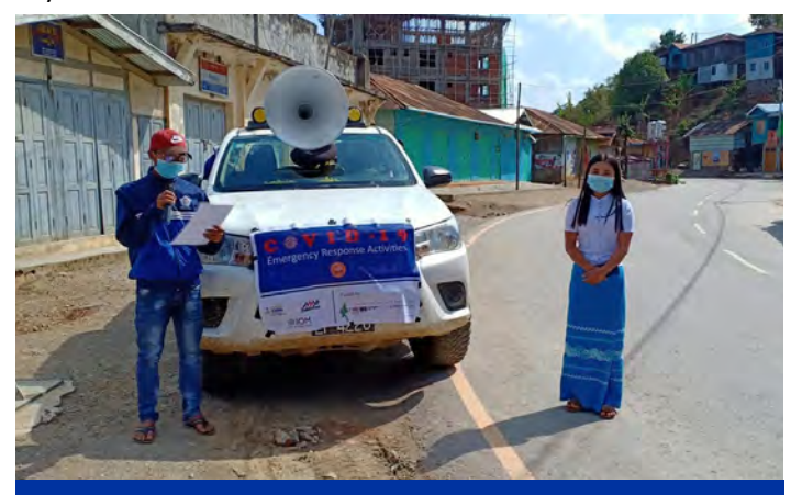
IOM partner, Chin Human Rights Organization (CHRO), disseminating COVID-19 risk communication messages via loudspeaker.

QFs in 39 townships in Shan; supporting the Shan State Minister to develop a costed plan for migrant workers returning from China; and providing IEC materials on home quarantine guidelines and COVID-19 protection to migrants returning to Kayin.