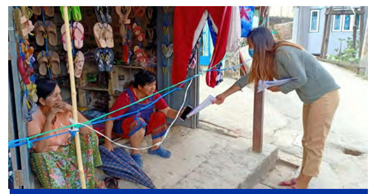
IOM partner, Chin Human Rights Organization (CHRO), distributing COVID-19 risk communication IEC materials in Chin State.

IOM continues engaging with State Health Departments to support the COVID-19 response, and in Kachin, IOM is distributing testing booths to all official points of entry to support Government health teams' COVID-19 testing. IOM has also provided 200 PPE sets, including surgical gloves and gowns, to public health authorities in Kachin, and it is currently supporting the renovation of an isolation ward at Lwelgel to support migrants returning from China. IOM and CSO partners continue the distribution of hygiene kits, PPE items, and WASH kits to quarantine facilities (QFs) and health centres, and reached 14,591 returning migrants and members of migrantsending communities in Chin, Mon and Kayin states, from 4 to 10 May. Community awareness-raising activities also continue, and IOM and CSO partners reached an estimated 156,559 members of migrant-receiving communities in Chin State and Magway and Mandalay regions with COVID-19 risk communication messages via loudspeakers on cars, from 4 to 10 May.