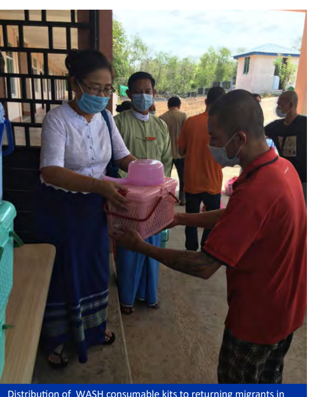
Distribution of WASH consumable kits to returning migrants in Dawei, Tanintharyi Region.

131 migrants also returned from Lao PDR through Won Pang checkpoint in Shan State, on 8 May.