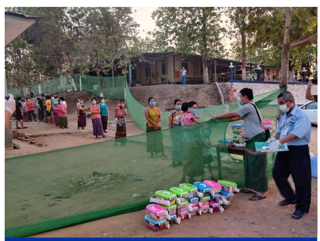
Distribution of WASH consumable kits to returning migrants quarantining for 21 days at a quarantine facility in Myawaddy, Kayin State.

through Kan Paik Ti and Lwegel border gates in Kachin State