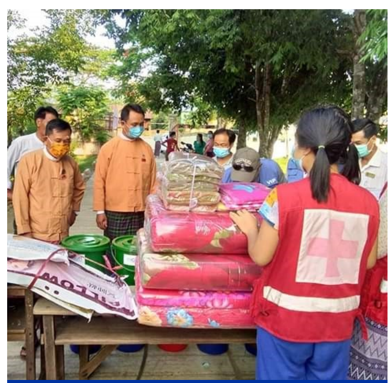
IOM partner, Metta Development Foundation, providing bed and WASH kits to a quarantine facility hosting returning migrants in Mohnyin, Kachin State.

Between 5 and 12 June, five cases of COVID-19 involving returns with recent travel history from Bangladesh, were identified in Rakhine State. Four of the cases have been Maungdaw Township, quarantined in and one asymptomatic case in Buthidaung Township.