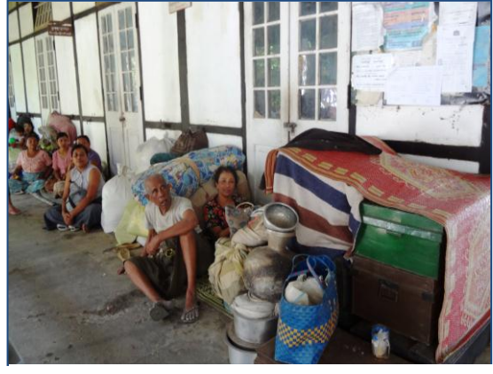
People in Ramree waiting for assistance

As of 31 October, the Rakhine State Government estimates that 35,058 people have been displaced in Kyaukpyu, Kyauktaw, Minbya, Mrauk-U, Myebon, Pauktaw, Ramree and Rathedaung. It has also been announced by the Office of the President that 89 people have been killed, 136 injured and 5,351 private and public, including religious buildings were burned or destroyed during the resurgence of the violence. Some people fled to areas close-by their villages;