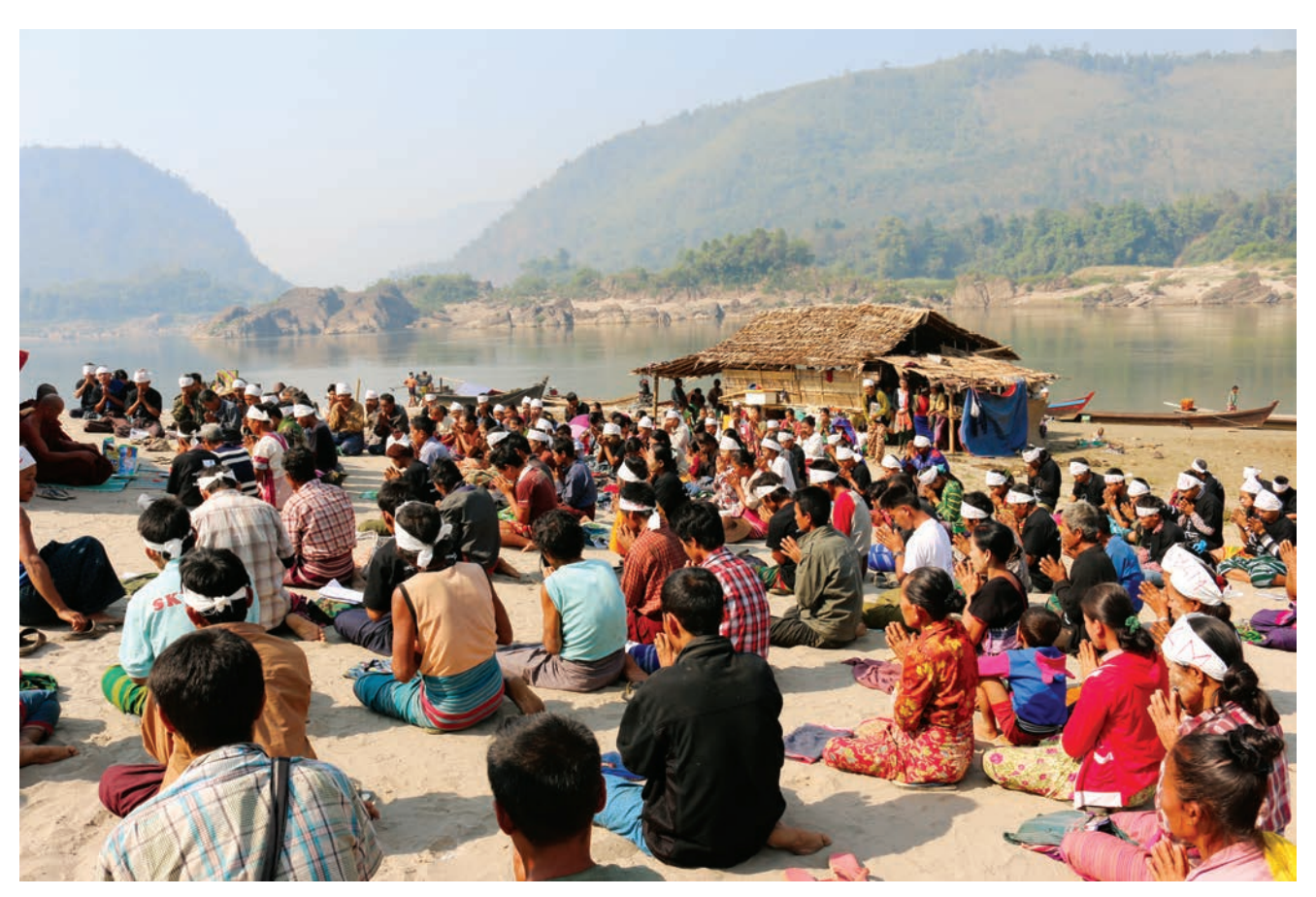
Villagers near the Hatgyi Dam site hold a demonstration opposing the Salween Dams.

The majority of IDPs interviewed by KRW believe that the most recent fighting is motivated by plans to build the Hatgyi Dam. A local resident from Myaing Gyi Ngu reported that BGF soldiers had told him that construction of the dam must begin in 2015 or 2016.