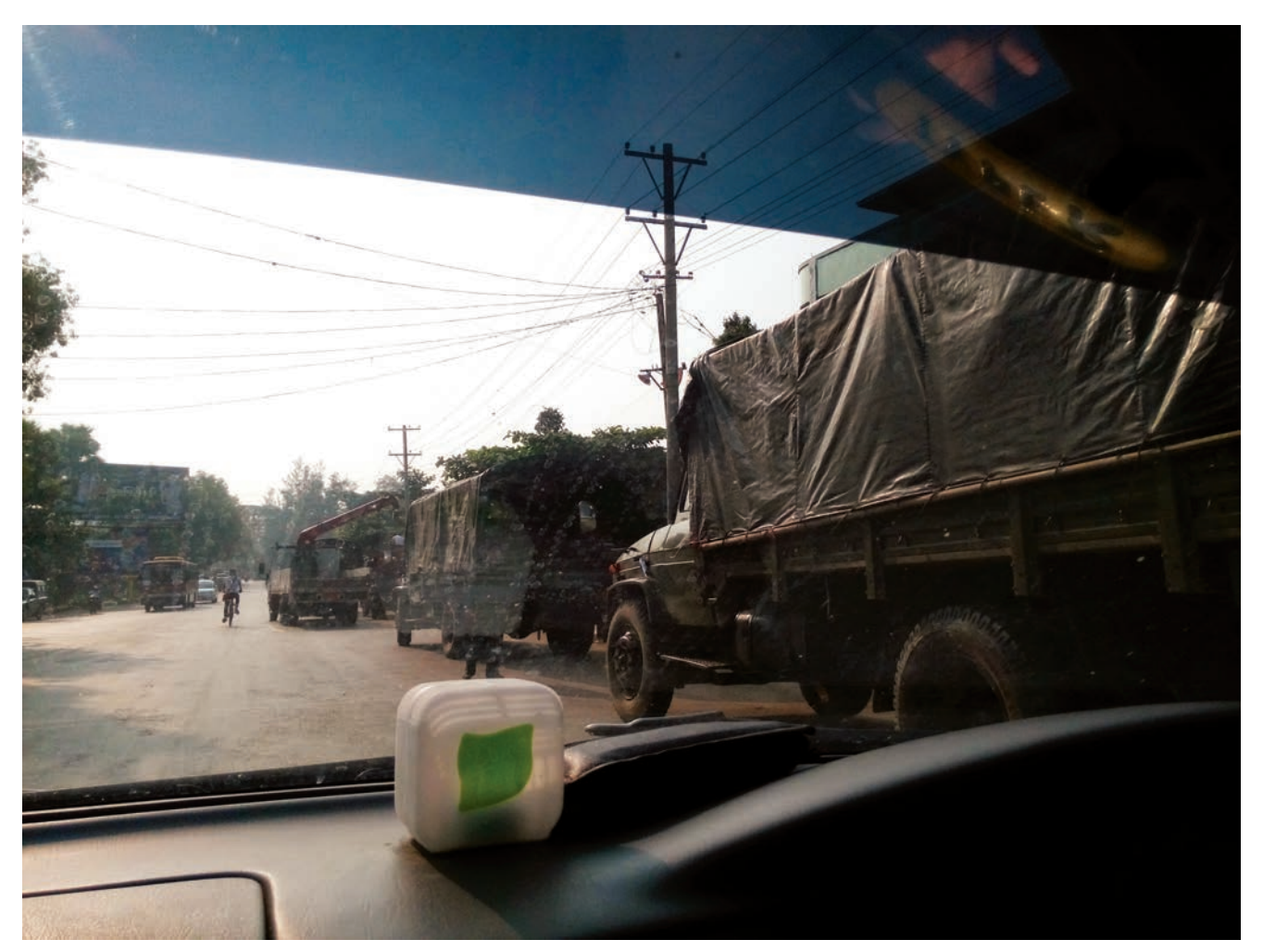
Burmese Army trucks carrying troops to the conflict area.

Shortly after the first clash at Me Zine Taung Chay, on October 8, the Burmese military began reinforcing their bases in the Salween River area of Hlaing Bwe and Bu Tho Townships, sending in nine truckloads of troops.<sup>5</sup>