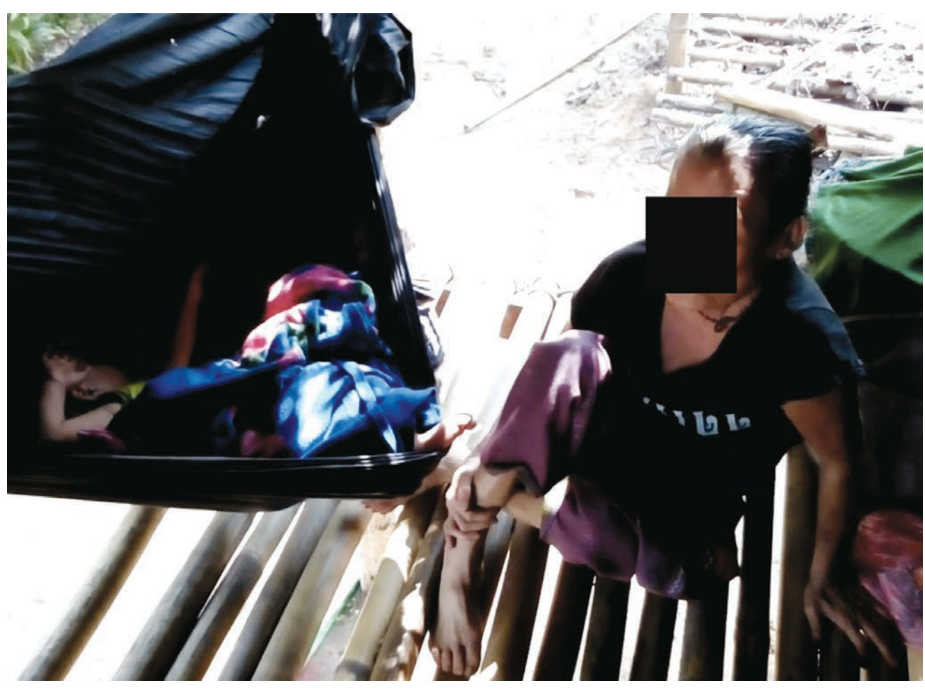
A woman and child displaced from their village.