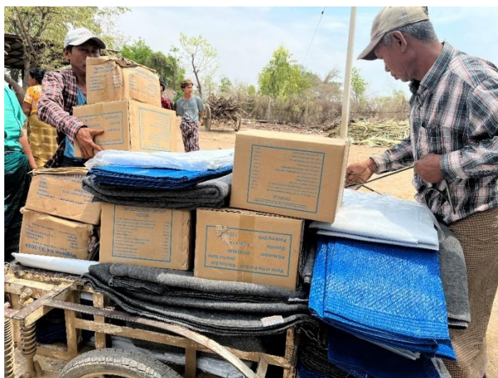
CRI distributions reaching vulnerable communities in urgent need

To learn more about UNHCR's response in Myanmar, please visit the Operational Data Portal and Global Focus Reporting .