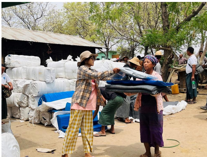
CRI distribution in Sagaing

To learn more about UNHCR's response in Myanmar, please visit the Operational Data Portal and Global Focus Reporting .