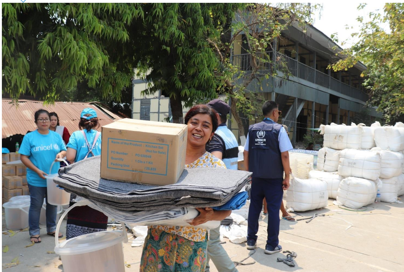
CRIs distributed to displaced communities at a makeshift site in Sagaing city on 3 April