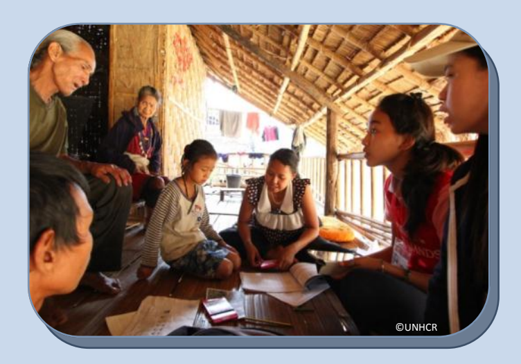
Listening to the concerns of the camps' residents

A refugee profiling survey commissioned by UNHCR is currently taking place in the nine refugee camps along the Thai border with Myanmar. The survey is being carried out by the Mae Fah Luang Foundation (under Royal Patronage). Refugees in Ban Mae Nai Soi and Ban Mae Surin camps eagerly participated during the month of March. First launched in other camps in 2013, the month-long exercise in these two camps in Mae Hong Son Province sought to assess the socio-demographic profile of the refugees and understand how they see their futures beyond life in a refugee camp.