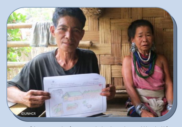
As part of the survey each refugee was asked to draw what would his ideal life look like. A good occasion to discover some hidden talents.

Such surveys can only succeed with the full understanding and support of the camps' residents. UNHCR has appreciated the strong collaboration with the refugee community, MFLF, and the Royal Thai Government. Community leaders in both camps took a very active role in the survey and with their help the vast majority of the residents in Ban Mae Nai Soi and Ban Mae Surin were happy to participate.