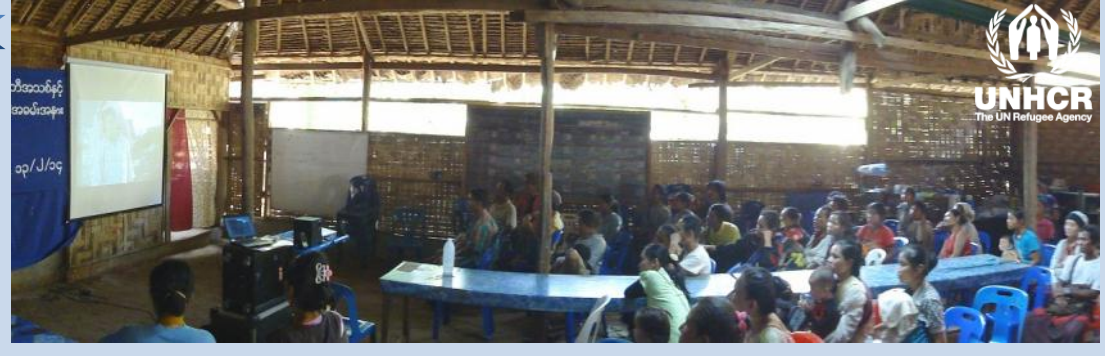
Starting in February 2014, UNHCR has been offering screening of the movie Cambodia Dream in the nine camps along the Thai-Myanmar border

"I think it's timeless and universal. It could be anywhere in the world. What is it about? It is about belonging. It's largely about tenacity, the resilience of humanity to overcome, to hold fast to a dream, not lose sight of it and achieve it. It's a really beautiful, pure, wonderful story about generosity, humanity, love, forgiveness, reconciliation. There is not one word of politics in that film. No one is right and no one is wrong."