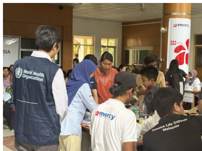
Mercy Malaysia's Emergency Medical Team (EMT) treated 150 patients per day in Kyaukse General Hospital in Mandalay