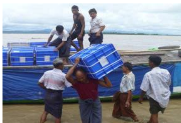
IOM and shelter partners have distributed over 10,800 shelter kits.

By October, humanitarian partners including UNHCR, the International Federation of Red Cross (IFRC) and IOM, had provided shelter assistance to over 145,600 people whose homes were destroyed or severely damaged. The World Food Programme (WFP) and partners delivered life-saving food support to over 455,000 people in the first weeks of the response and will continue to provide food assistance to the most vulnerable until then end of the year. Starting from November, cash-based assistance or income generation projects will replace food assistance in some locations where there is access to markets to allow affected people to purchase their own food.