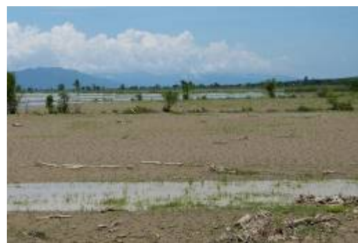
Mud and debris still covers vast areas of farmland in Sagaing.

Bilateral support was provided by governments in the region and around the world. The United Nations and international organizations also mobilized to support the Government-led response. In strong contrast to the situation in 2008 after Cyclone Nargis, the Government welcomed international assistance and there was strong cooperation from the start, with concerted efforts being made to ensure an integrated approach to emergency relief and longer term recovery. It is clear that many of the lessons learned after Cyclone Nargis had resulted in vastly improved national preparedness and response, and this no doubt saved many lives. For example, much better early warning systems and emergency preparedness measures were in place in areas like Ayeyarwaddy, which were badly affected by Cyclone Nargis and which had benefitted from many subsequent disaster risk reduction efforts. However, places like Sagaing, Magway and Rakhine were far less well prepared for a flooding emergency on this scale and communities continue to face major challenges in recovering from the devastating effects of this disaster.