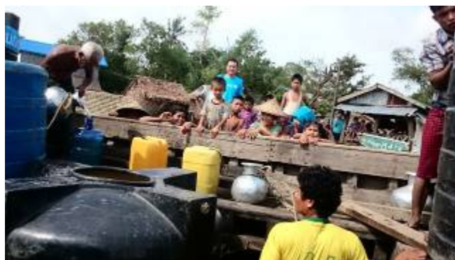
UNICEF and partners distributed water to over 1,600 people in Sa Par Htar village, Ponagyun township in Rakhine.

The UN and INGOs have been responding to the humanitarian and recovery needs of all affected communities across the state. This includes distribution of food, clean water, blankets, mats and kitchen sets, provision of emergency healthcare and medicines, shelter materials, and emergency education and protection services, as well livelihoods and agricultural support to help families recover. Flood response activities are currently ongoing or planned in over 500 village tracts/towns in Rakhine State.