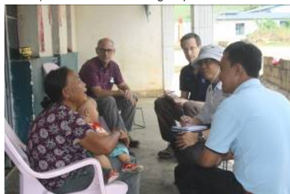
OCHA talks to community members during a mission to Kokang in September 2015.

According to the Relief and Resettlement Department in Lashio, of the 60-70,000 people who fled to China after fighting broke out in February, some 8,000 people remain across the border, while others have now returned. People have primarily returned to the Laukkai area and in the area south of Laukkai. The Government has said it plans to accommodate IDPs who remain in China in three transit centers, where they will be provided with assistance and screened before returning.