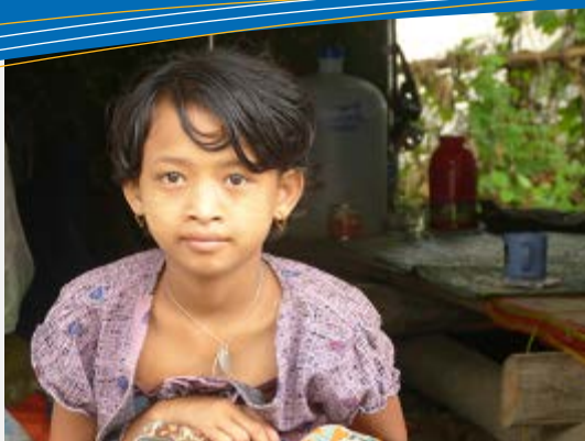
A young girl in a Kale flood evacuation site, Sept. 2015.