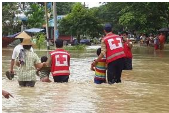
MRCS volunteers helping children in Moe Kaung, Kachin State, July 2015

The Myanmar Red Cross Society (MRCS) played a key role in the immediate response to the floods, supporting over 380,000 people with emergency evacuations. MRCS also reached over 70,000 people with distributions, including food, non-food items such as blankets, mosquito nets, kitchen sets, family and hygiene kits, as well as tarpaulins and shelter tool kits. They provided vital first aid and other health interventions. MRCS and its partners are now moving to early recovery activities with a focus on unconditional cash distributions and livelihoods activities in Chin, Sagaing and Magway. In addition, MRCS staff and volunteers are focusing on prevention of malaria and dengue, water and sanitation interventions and disaster risk reduction work.