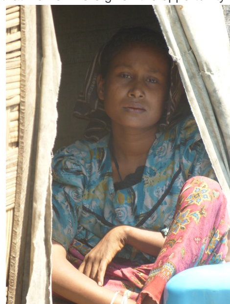
A displaced woman in an IDP camp in Rakhine, March 2015.

In 2016, the humanitarian community in Myanmar continues to further integrate protection into programmes and activities. In March, the Protection Sector conducted a series of consultations, which identified a number of follow-up actions. These include reinforcing the commitment to protection by UN and NGO actors; strengthening analysis, information-sharing, communication and advocacy around protection; and ensuring that protection is integrated into all humanitarian activities.