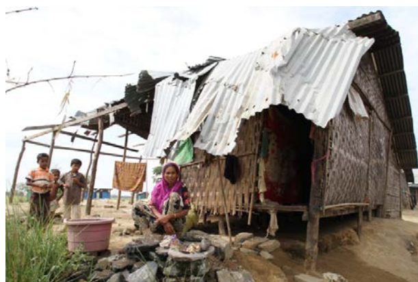
Shelter damaged by Cyclone Komen, Nov 2015.

About 120,000 people remain displaced in 39 camps or camp-like settings across Rakhine State as a result of the inter-communal violence that broke out in 2012. While some repair and maintenance work occurred in 2014 and 2015, many of the long-houses that were built in 2013 as a temporary measure to last for two years are now in very poor condition. They have weathered three monsoon seasons, as well as Cyclone Komen, which made landfall in southern Bangladesh, close to Rakhine State, in July 2015. The next rainy season is two months away. Ensuring that people are protected from the elements and that they are able to live in dignified conditions is an increasingly critical need. This is particularly the case in Pauktaw and Myebon townships, where many shelters will have to be almost entirely rebuilt, with only 5 per cent of the original building structure being salvageable. Water and sanitation infrastructure is also in need of repair and maintenance in many IDP camps.