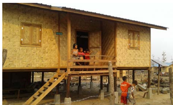
Newly built houses for flood affected people in Kalay, Sagaing, March 2016.

Of the approximately 11,000 people who were staying in flood evacuation sites in Chin State and Sagaing Region at the end of October 2015, over 7,000 people had been relocated as mid-March 2016. People being relocated to new sites or returning to their villages of origin have received new housing or materials from the Government. In many of the relocation sites the state government, MRCS, the UN and national and international NGOs have provided water and sanitation facilities, cash assistance and other support. There is however still a need for improved access to healthcare, schools and other basic services at some sites, as well as for improved roads in villages, and an overall need to help people reestablish their livelihoods to ensure long-term recovery. Some families in Kalay Township also still need support to rebuild their houses.