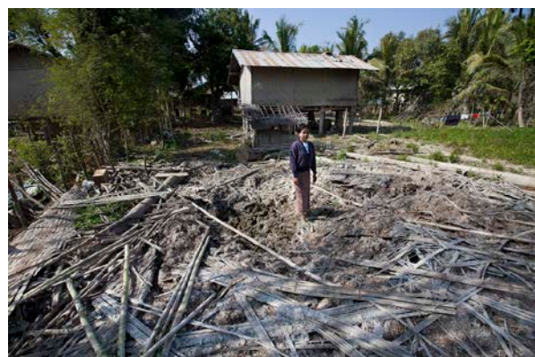
A woman stands amidst debris on her land in Sagaing following the 2015 floods, Dec. 2015.

In addition, the assessment found that the flooding exacerbated malnutrition in areas where malnutrition rates were already high, most notably Rakhine and Chin states. According to UNICEF, the Nutrition Sector lead, other factors also influenced the rise in malnutrition rates in these areas, including a change to the global WHO child growth standards, which along with the floods and chronic vulnerabilities aggravated the situation. Continued capacity building of local government systems to periodically monitor children's nutrition and deliver prevention and nutrition treatment interventions should be prioritized, according to the Nutrition Sector.