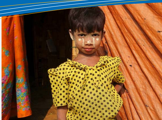
A girl in an IDP camp in Rakhine, Feb 2016.

$ 10 million New contributions reported in 2016. (Includes $6 million for activities in the Humanitarian Response Plan and $4 million for other activities).