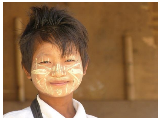
Boy at school in Je Yang IDP camp, Laiza, Kachin, February 2014.

Working with the Government of Myanmar, the UN and NGO partners will be working to ensure that all crisis-affected people in the country receive the assistance and protection they need, irrespective of their ethnicity, nationality, religion or gender, in accordance with humanitarian principles. This includes providing critical food and nutrition assistance, strengthening protection monitoring and services for vulnerable people, ensuring equitable access to education opportunities, providing water/sanitation/hygiene services, ensuring that displaced people have adequate shelter, improving access to life-saving healthcare and ensuring that they also have access to livelihoods opportunities, training and other services.