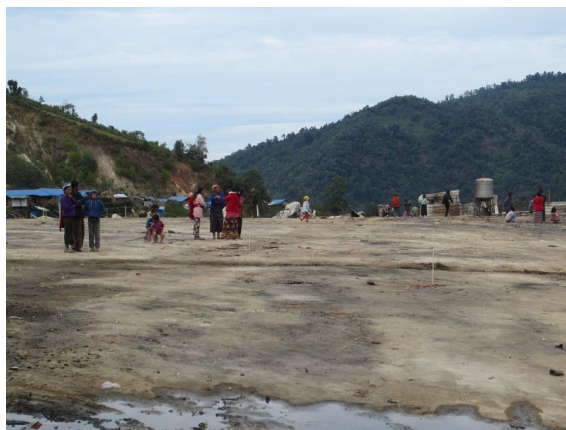
A fire destroyed 88 shelters in Shing Jai camp, Kachin, 29 December.

The fire also destroyed a health clinic in the camp, as well as medicine stocks. Humanitarian organizations are in the process of replacing stocks. There will also be a need to construct new latrines and bathing facilities as some structures were damaged in the fire. More tools and equipment are also needed for home gardening as affected families lost these in the fire. The local school outside the camp, which 83 primary school children from Shing Jai attend, was unaffected by the fire.