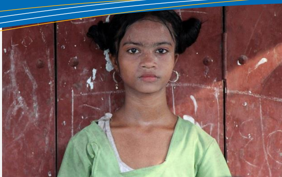
Girl in Aung Mingalar Quarter, Sittwe, June 2014 Credit: OCHA

Source: UNHCR, OCHA, CCCM, Mandalay Regional Government