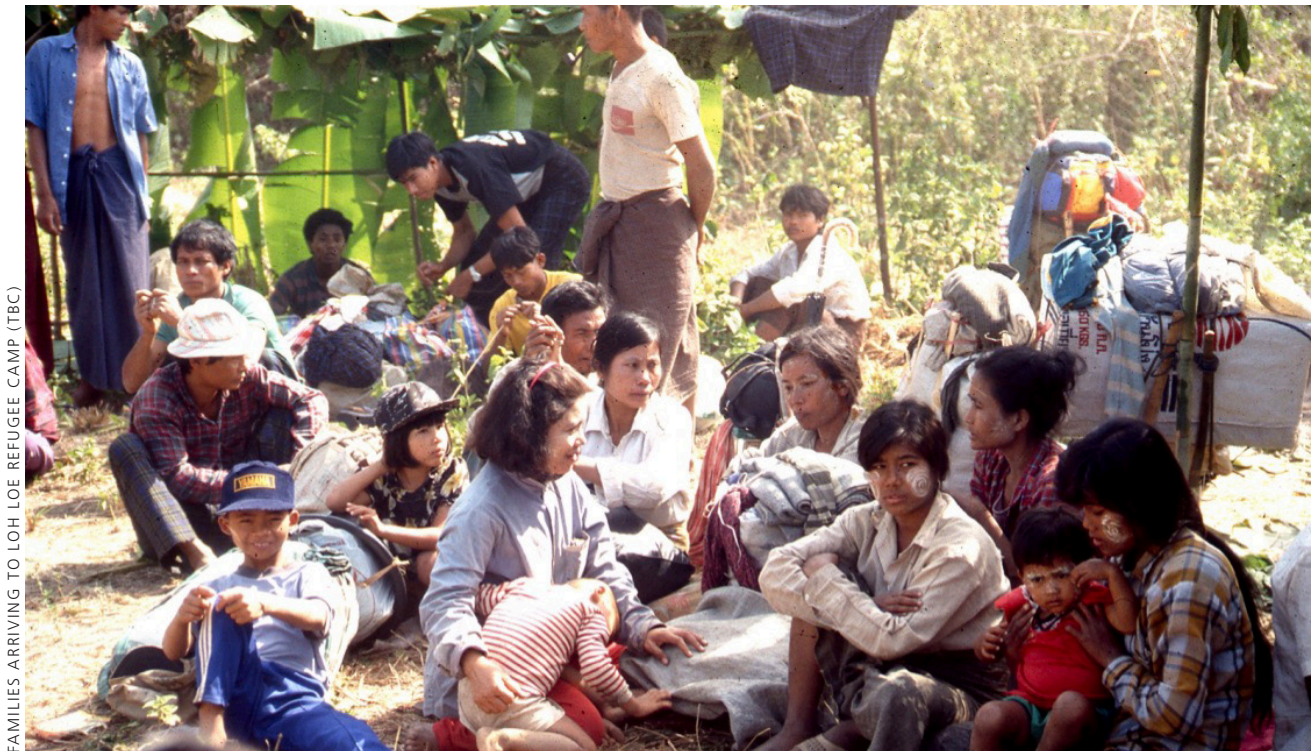
FAMILIES ARRIVING TO LOH LOE REFUGEE CAMP (TBC)