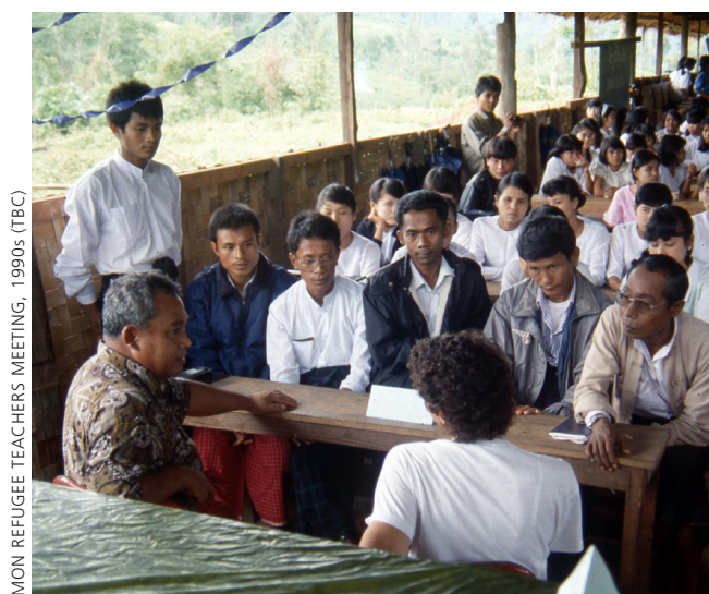
MON REFUGEE TEACHERS MEETING, 1990s (TBC)