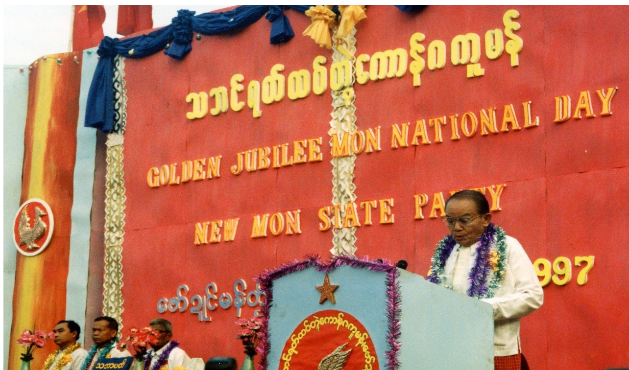
NMSP CELEBRATES GOLDEN JUBILEE MON NATIONAL DAY, 1997 (NA)