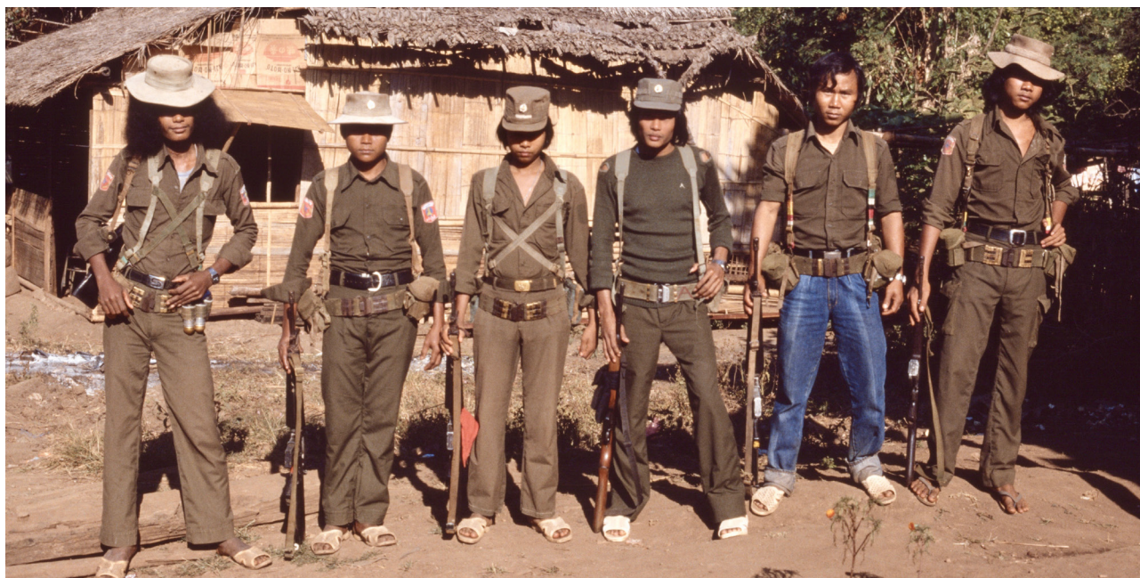
NMSP TROOPS ON FRONTLINE PATROL, 1985 (MS)

mostly in Mon State, with the remaining six locations – designated as temporary – in the Tenasserim Division far to the south of the NMSP general headquarters in Ye township. The Tatmadaw then planned to take over areas in Ye township and other territories where the NMSP was formerly active. Ye township is very large, and it has rich resources, including rice fields, rubber plantations, betel-nut plantations and many other kinds of fruit farming.