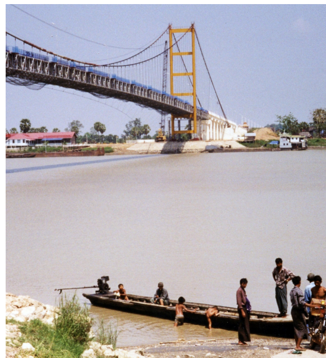
CONSTRUCTION OF POST-CEASEFIRE BRIDGE OVER THE GYAIN RIVER

There was also disappointment on the social and economic fronts. For the next 15 years, much of the country remained in a highly militarised state. While the NMSP sought to expand education and welfare programmes, development for SLORC-SPDC officers meant roads, railways and infrastructural projects. This was evidenced by the construction of major bridges over the Attaran, Gyaing and Thanlwin Rivers, opened in 1998, 1999 and 2005 respectively. During a time of humanitarian need, ceasefire critics argued that these were of more strategic benefit to the government than economic delivery to the people.