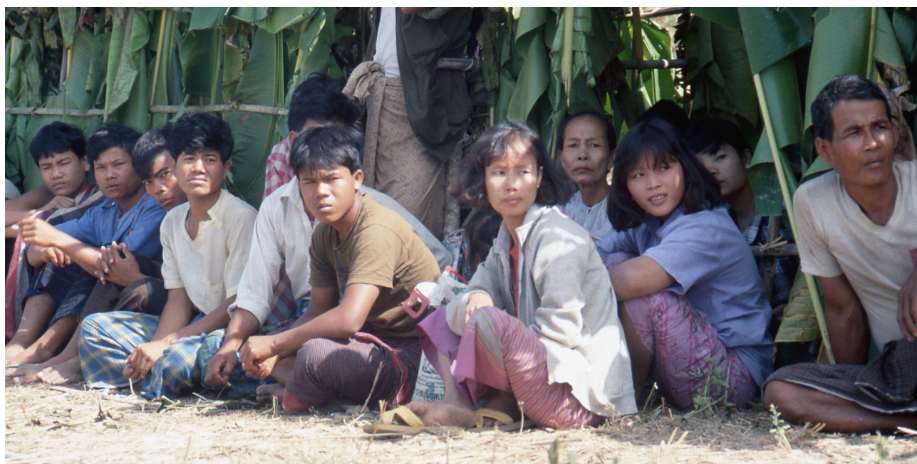
YOUNG MON PEOPLE FLEEING FORCED LABOUR AT THAI BORDER (TBC)

This pattern changed with the 1995 ceasefire. The agreement re-grouped all MNLA troops into 14 designated locations that are