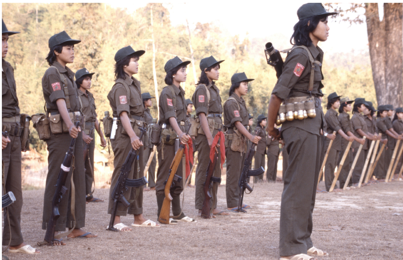
NMSP WOMEN SOLDIERS AT THREE PAGODAS PASS, PRE-CEASEFIRE (MS)