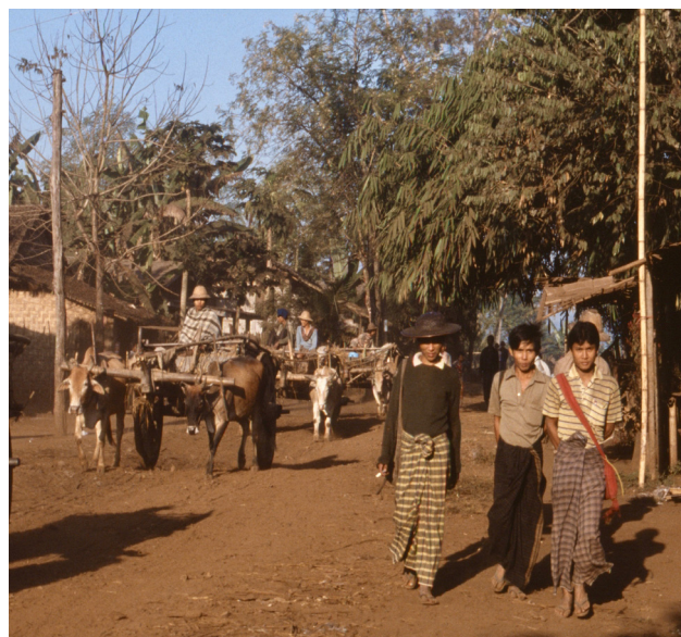
MON TRADERS ON THE WAY TO THE THAILAND BORDER, BSPP ERA (MS)

It was also during this period that the NMSP's political standpoint evolved into the pro-federal form that it still retains today. In a 1972 statement, the party declared that it would continue the struggle for an "independent sovereign state" unless the "Burmese government" allowed a "confederation of free nationalities exercising full right of self-determination inclusive of right of secession". 13 But, as the statement implied, this was an opening position from which Mon leaders wanted to negotiate with other parties to find compatible solutions. In line with this policy, the NMSP became a key actor in "united front" politics, a practice that it has since continued.