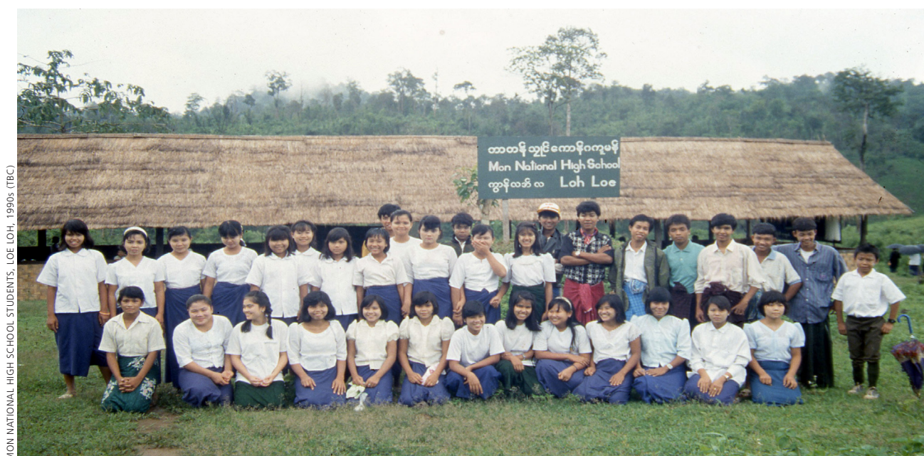
MON NATIONAL HIGH SCHOOL STUDENTS, LOE LOH, 1990s (TBC)