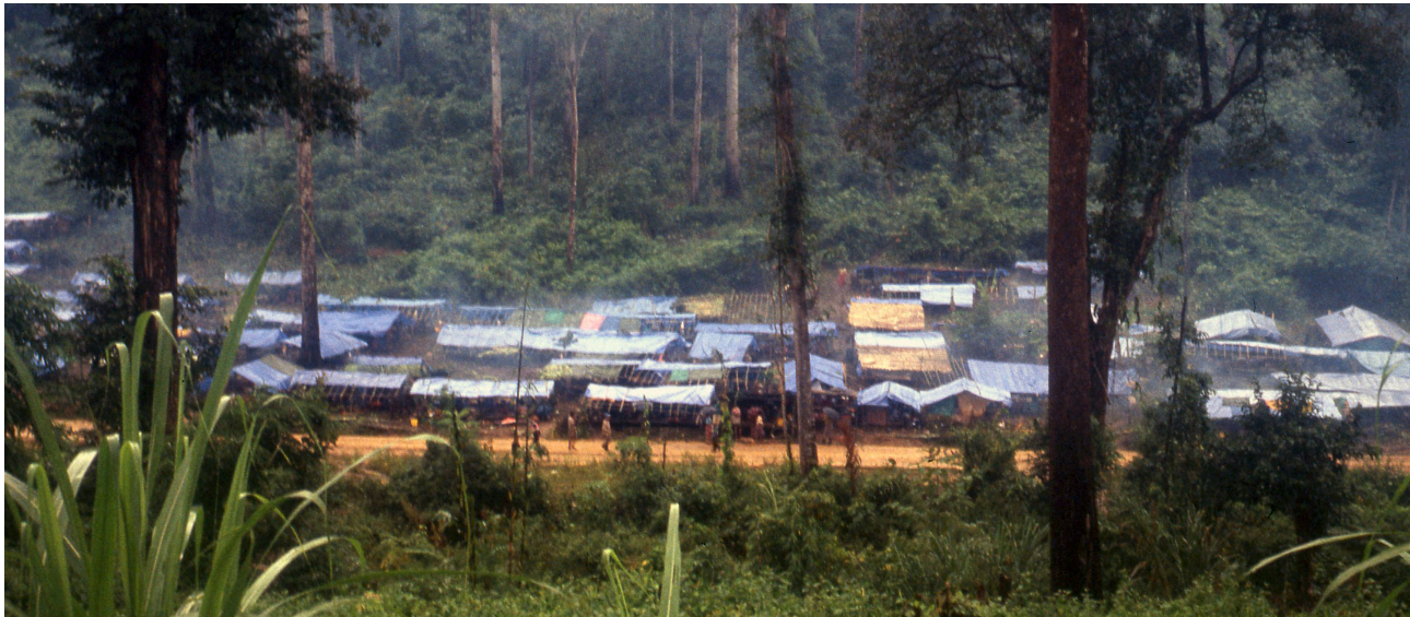
HALOCKHANE REFUGEE CAMP, RAINY SEASON 1994 (TBC)

rounds of informal meetings during 1994. But the negotiations were deadlocked after agreement could not be reached on the location of MNLA base camps and the NMSP's territorial control.