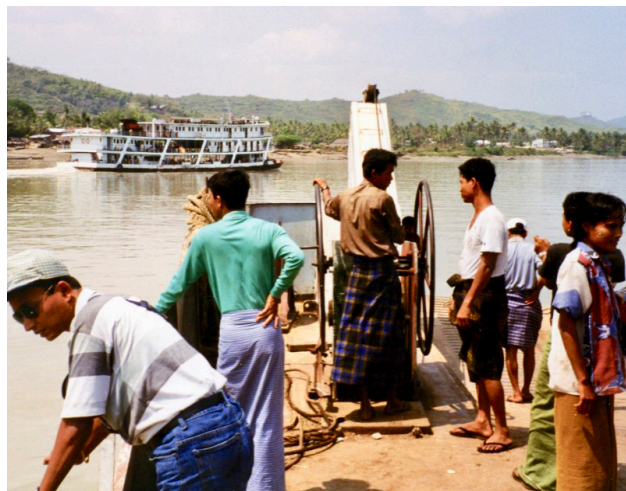
MAWLAMYINE TO MARTABAN FERRY BEFORE CONSTRUCTION OF THANLWIN BRIDGE (MS)

demands in the fields of human rights and politics ("the anti-politics machine" 58 ).