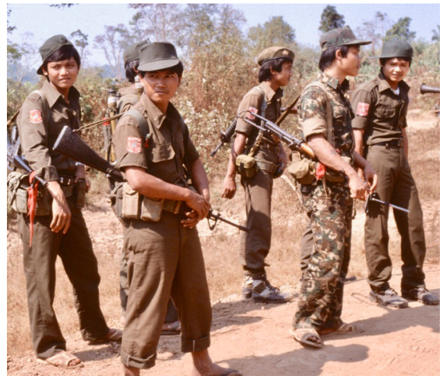
NMSP TROOPS ON THE ROAD TO THANBYUZAYAT 1989 (MS)