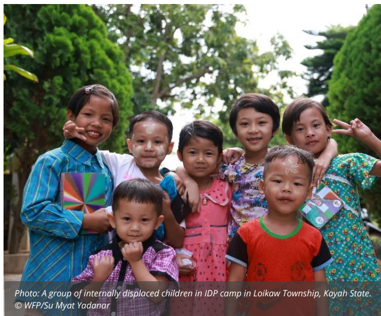
Photo: A group of internally displaced children in IDP camp in Loikaw Township, Kayah State. © WFP/Su Myat Yadanar