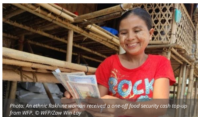
Photo: An ethnic Rakhine woman received a one-off food security cash top-up from WFP.

Photo: An indigenous Kayan woman seen with WFP relief assistance in an IDP camp in southern Shan state.