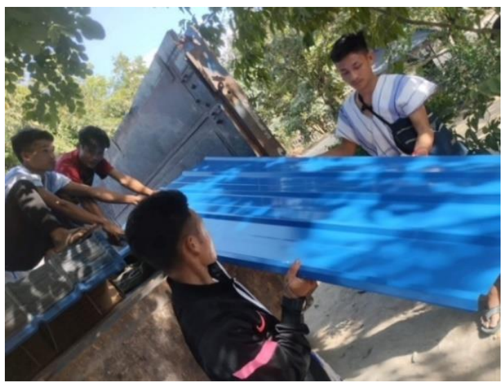
UNHCR and partners distributing shelter materials in Bago (East) Region