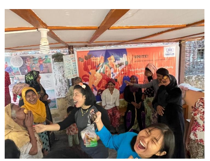
Community members participating in the 16 Days of Activism against Gender-Based Violence campaign in Rakhine State