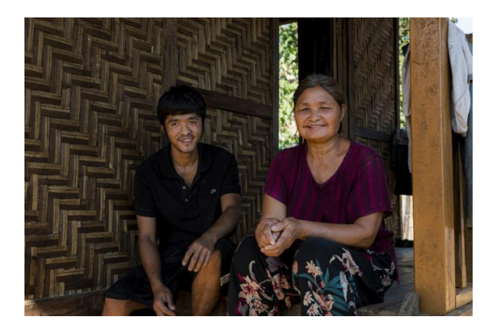
[STORY] Empowering Displaced Communities in Myanmar's Northeast