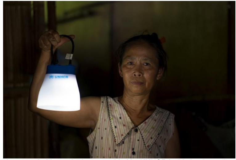
A woman holds a solar lamp provided by UNHCR inside her home in Shan State (North)