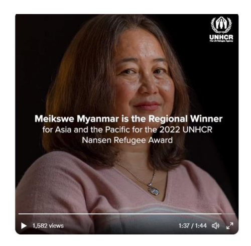
[VIDEO] Meikswe Myanmar, UNHCR Nansen Award 2022 regional winner for Asia and the Pacific assist communities in need