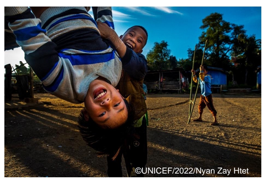
Children playing in a camp of northern Shan State

UNICEF is supporting access to justice for children by partnering with 89 legal aid providers and lawyers (which covers all the states except for Mon). Legal aid support was provided for 635 children (359 boys and 276 girls) and 545 young people (365 male) under 25 years, including 216 Rohingya children with migration charges (142 girls) and 66 children (61 boys) charged with affiliation to the People's Defence Force. UNICEF is currently rolling out a multisectoral mental health and psychosocial support (MHPSS) strategy for 2022-2025, focusing on the provision of good quality MHPSS services to children and caregivers. UNICEF introduced a targeted MHPSS activity for adolescents and young people in crisis: training U-Reporters as youth leaders in "I Support My Friends" - a