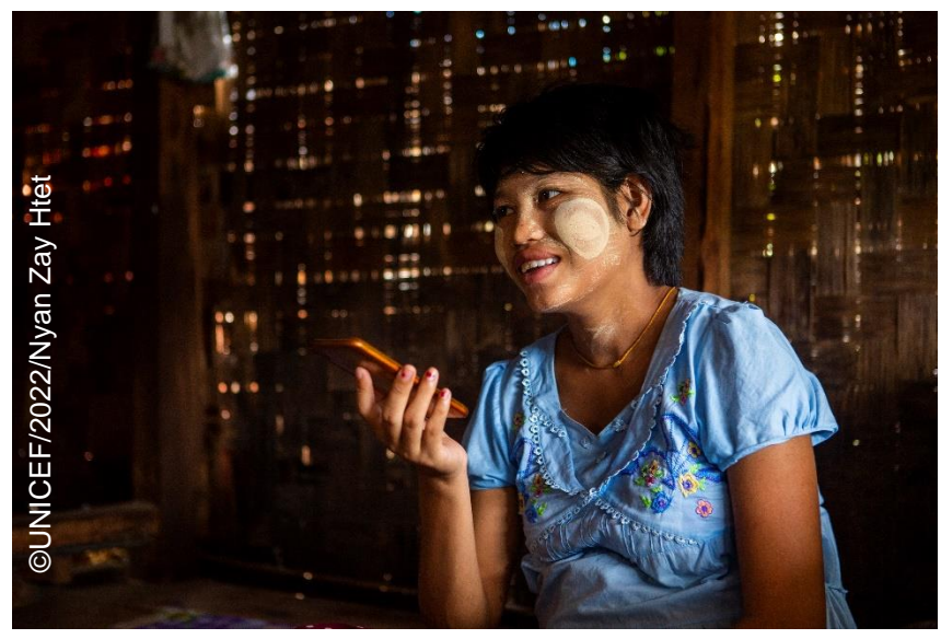
A pregnant woman receiving health counselling service via mobile phone

Some key challenges faced in the first six months include banking and cash liquidity issues. However, UNICEF, in collaboration with NGO partners and its financial service provider managed to make three payments in the first half of 2022. The Bright Start mobile microinsurance programme primary health care services has covered 27,500 participants (69 per cent of the total target of 40,000 set out in 2022 HAC). By the end of June 2022, the Bright Start expansion programme had reached 20,589 active programme participants, including 18,598 children under 5 and 1.991 pregnant women in Yangon peri-urban townships. UNICEF also continued to provide the Bright Start pilot programme for primary health care services in the Yangon peri-urban townships of Hlaing