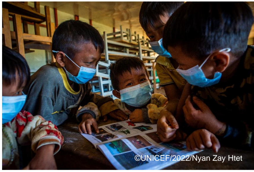
Children at temporary learning school in a camp. Northern Shan State

facilitated children's access to formal and non-formal education, including early learning by providing education supplies, learning materials and education services. Key activities included the development of open learning materials to reach the children, vulnerable the repairs construction of learning centres, the provision of volunteer teachers' incentives, and the promotion of hygiene and awareness enhancement for COVID-19 prevention. UNICEF and its partners also provided individual essential learning packages for 90,779 children (46,600 girls). In addition, 15,554 children/adolescents (7,830 girls) were reached through UNICEF-supported skills development interventions.