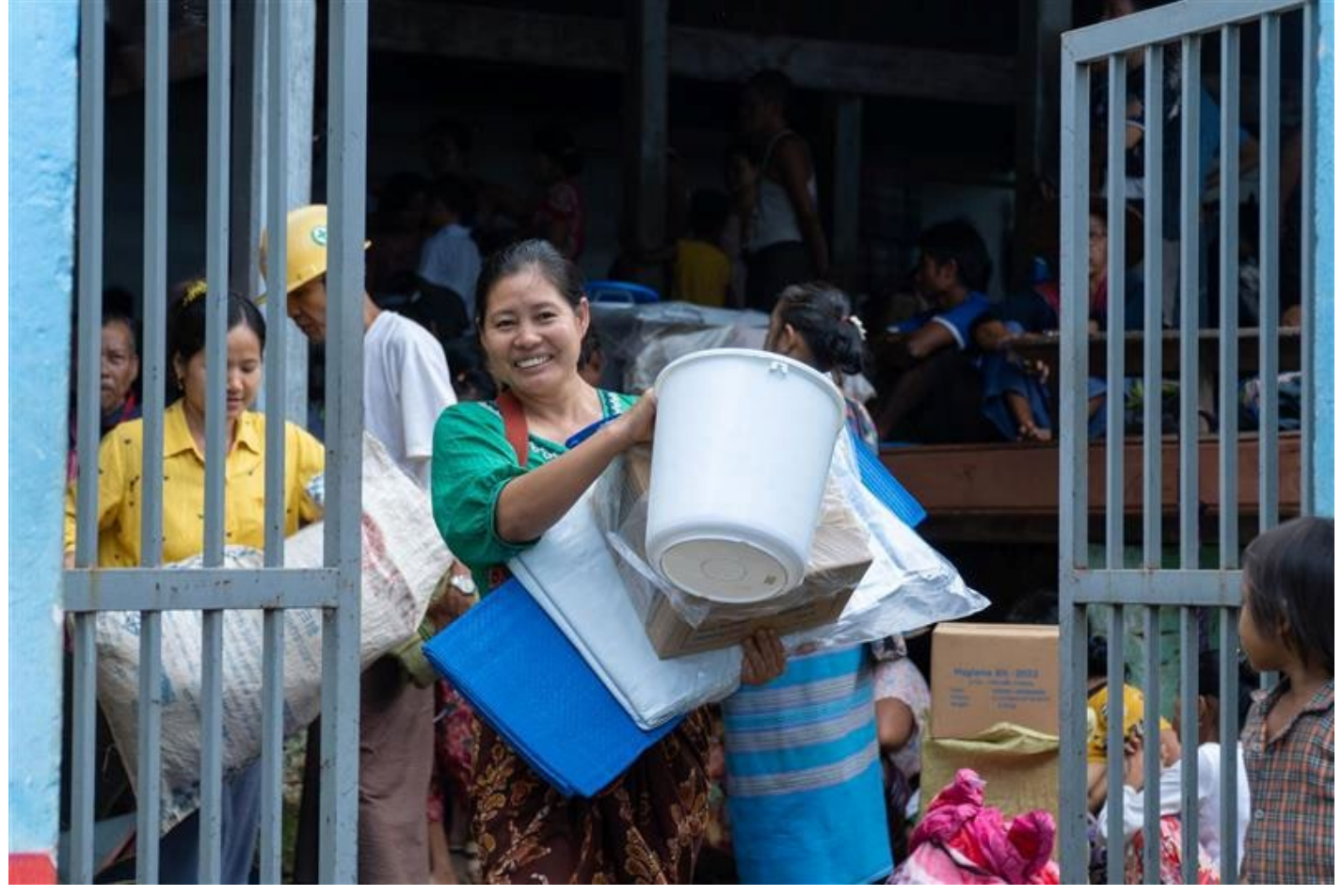
UNHCR and partners provided shelter materials and CRIs to over 7,000 displaced people affected by conflict in Myawaddy and Kyainseikgyi Townships, Kayin State in July.