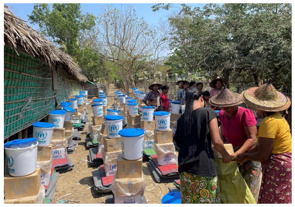
UNHCR and partners distributing CRIs in Rakhine State (North)

Authorities in Manipur announced plans to establish temporary accommodation in Tengnuopal and Chandel districts for new arrivals. A sub-committee has also been set up to extend temporary accommodation in two other districts – Churachandpur and Kamjong – both of which collectively shelter more than 2,500 arrivals, according to estimates by civil society organisations. Myanmar arrivals welcomed the decision to establish temporary accommodation although their reaction is mixed since many arrivals have been staying in their current accommodation for over a year and prefer to continue doing so.