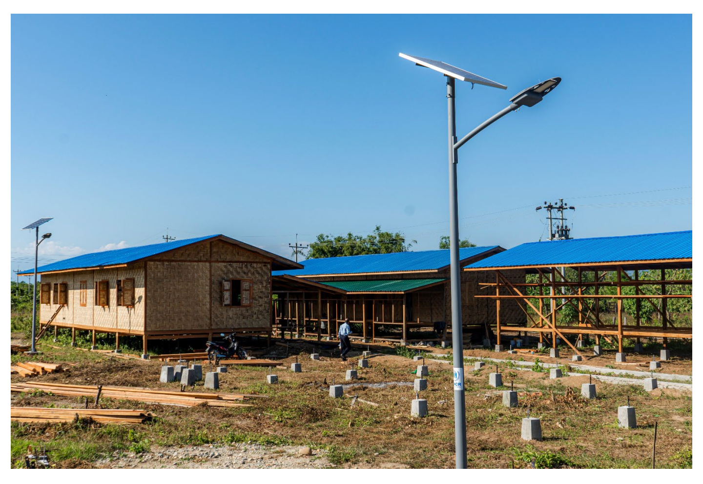
UNHCR provides targeted shelter support to IDPs in Kachin State. New homes are constructed for families and solar streetlights are installed to illuminate pathways and provide a sense of security.