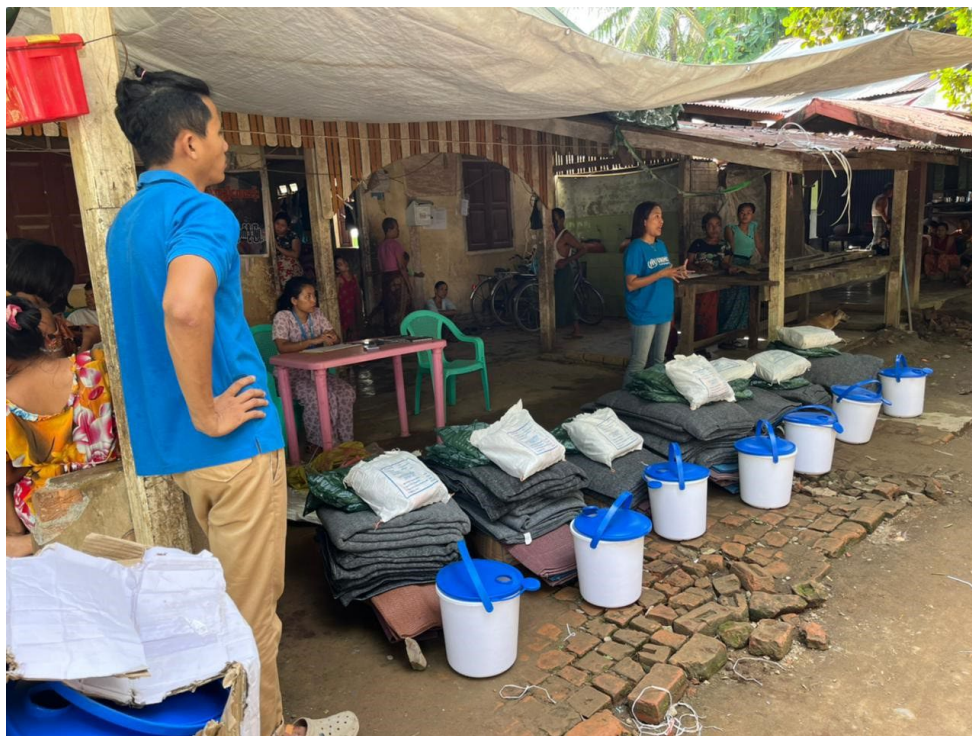
Standard core relief items being distributed to recently internally displaced families in Rakhine State