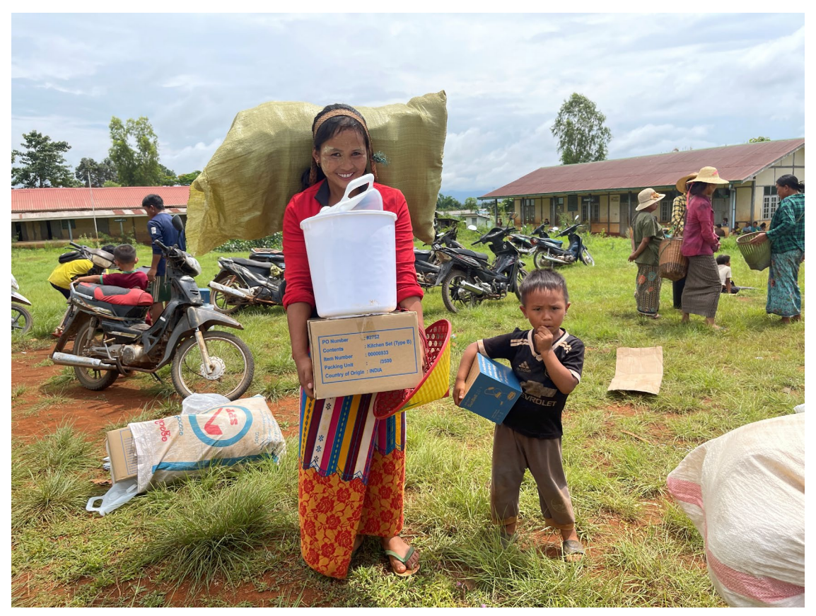
UNHCR and its partners are providing relief items to internally displaced and host community families in Kayah State, Myanmar

There was an uptick in cross-border movement in June following armed clashes in the north-west regions of Myanmar. Floods in the neighbouring state of Assam – where relief goods are procured and transported – also hampered aid distribution by local community-based organizations. With the start of the monsoon season in June, there is an urgent need for semi-permanent shelters in Mizoram and Manipur. Other needs across various new arrival settlements include WASH, food, health, NFIs and livelihood assistance.