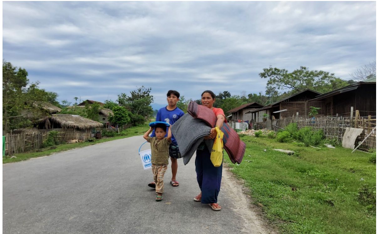
An internally displaced family receive blankets, mats and other non-food items in Kachin State, Myanmar.

Through triangulation of information, it is estimated that over 33,700 Myanmar nationals have arrived in India to seek safety and protection, with 16,900 of them having arrived this year alone. Host communities and CBOs continue to face resource constraints in responding to humanitarian needs. UNHCR's partner SPHERE, in collaboration with UNFPA, conducted intensive mental health training for staff members of the GBV government-led one-stop crisis centres and CBOs in Mizoram and Manipur. Consultations were also held by SPHERE with government stakeholders and local CBOs in the two states to strengthen the child protection response. UNHCR partner Action Aid is completing its last round of food and NFI distribution targeting 3500 vulnerable households. In Delhi, 2,819 individuals have approached UNHCR's office for registration, of which 254 are unaccompanied minors and separated children. Best Interest Assessments have been initiated for the children and they are being provided support by UNHCR partner in Delhi, BOSCO.