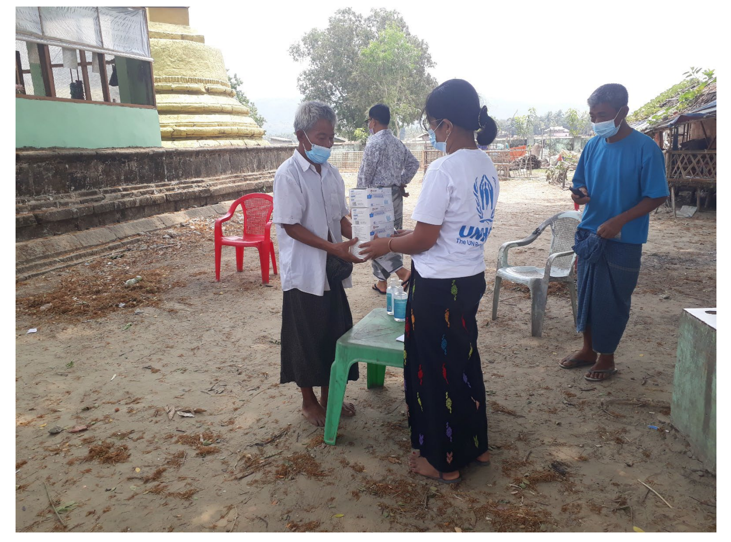
As part of its COVID-19 prevention response, UNHCR distributes face masks to displaced families in Rakhine State, Myanmar.