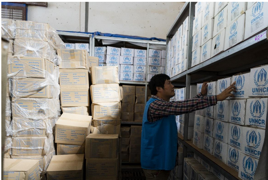
UNHCR is pre-positioning relief items in its warehouses to swiftly respond to various emergency situations in Myanmar