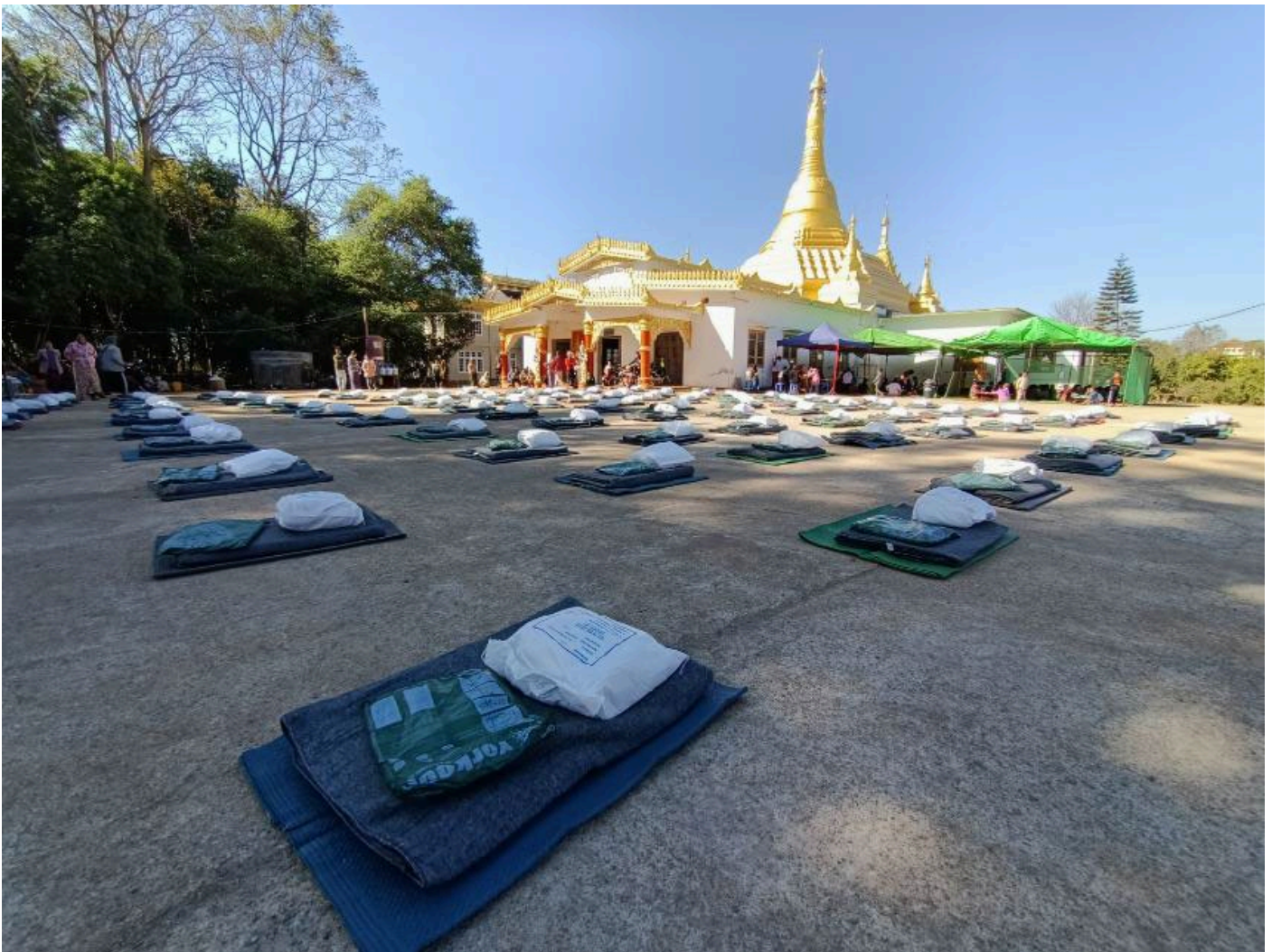
Distribution of non-food items to displaced families in Shan State.

Through triangulation of information, it is estimated that around 31,000 have fled Myanmar to seek safety and protection in India and are presently in the northeastern border states, with some 15,000 of them having arrived just in the past two months. Host communities and CBOs are aiding the new arrivals with immediate lifesaving assistance, and children of those who fled are being integrated into the local education system, with some set to sit for exams this month. Remote protection training on GBV case counselling was provided for local response providers.