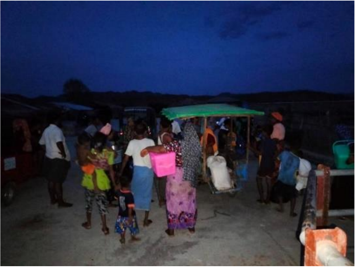
Rohingya people from Taung Paw moving to an evacuation site ahead of cyclone Mocha. Myebon township, Rakhine.