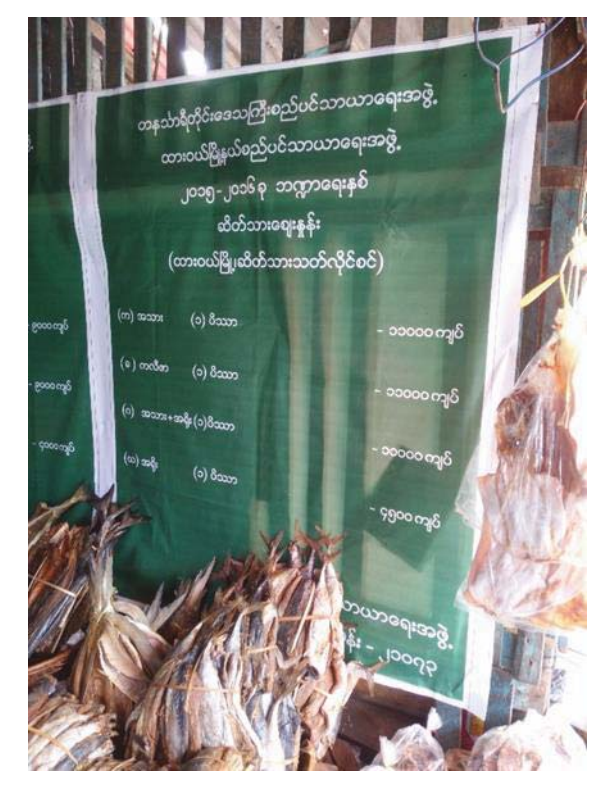
DAO-mandated list of prices for beef at a market

A similar system applied in other locations. In another township, anyone with a National Registration Card can apply for a slaughterhouse license, and the price is fixed at 500,000 kyat (US$390.32). If more than one bid is received, the fee is split equally between all bidders.<sup>239</sup> This system has been in effect since FY14-15, though previously the licenses had been distributed through auction, where fees could reach as high as five million kyat. The prices of pork and beef remain fixed by the government, though they have not risen for at least the last three years.<sup>240</sup> The DAO officers thought that the current licensing system had a number of benefits, including creating business opportunities for locals (businesses from other townships are not eligible to receive a license), as well as keeping the meat price stable (the officials perceive that auction licenses drive prices higher, despite their fixing of the price).<sup>241</sup>