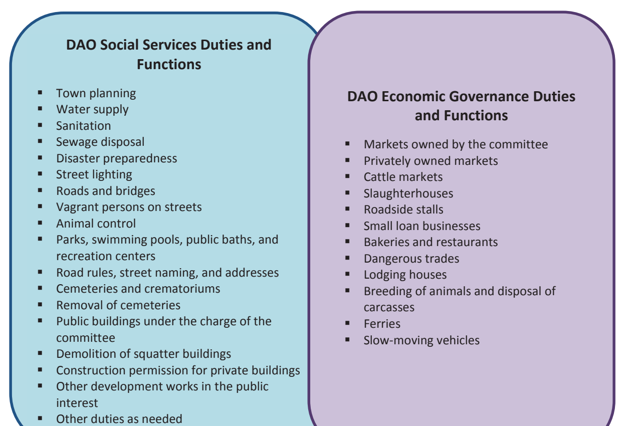
Figure 1. DAO Social Service and Economic Governance Duties and Functions<sup>34</sup>

selected consumer goods or services.<sup>33</sup> Business licenses for operation in some sectors, such as slaughterhouses, ferries, and pawnshops, are available only through auctions held by the DAO, which run once per year. DAOs also issue construction permits for private construction projects, and participate in issuing construction permits for public projects. They issue licenses for advertising billboards in urban areas. A comprehensive list of the social services and economic governance responsibilities of DAOs is contained in Figure 1.