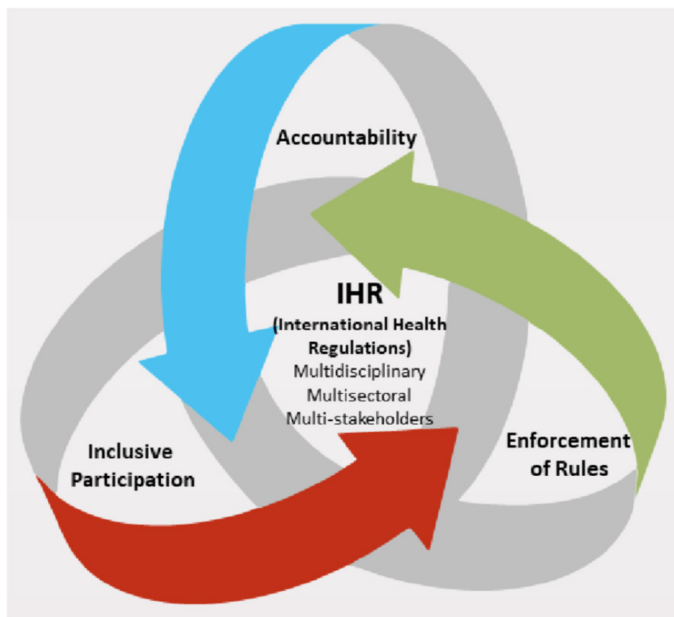
Figure 2 Key governance principles essential in strengthening IHR compliance. IHR, International Health Regulations.

within and across different ministries. This includes partnership working with civil society organisations (CSO) and bilateral and multilateral organisations due to the ‘changing nature in increasing emergence and re-emergence of infectious, non-infectious and other PHEIC across the world’. 13 Furthermore, fostering a culture of internal coherence and joint working between different departments of the MOHS as well as outside the ministry is recognised as vital. In this context, good governance is critical as without it collaboration and multisectoral working cannot be effectively achieved. However, governance is an abstract and diffuse concept. 27 28 To promote governance in one single sector itself is challenging. Hence, promoting governance to strengthen IHR compliance where multisector collaboration is key to its success, is even more challenging. Among different principles of governance, three governance principles—accountability; inclusive participation; and enforcement of rules—are essential to strengthen IHR compliance in Myanmar (figure 2).