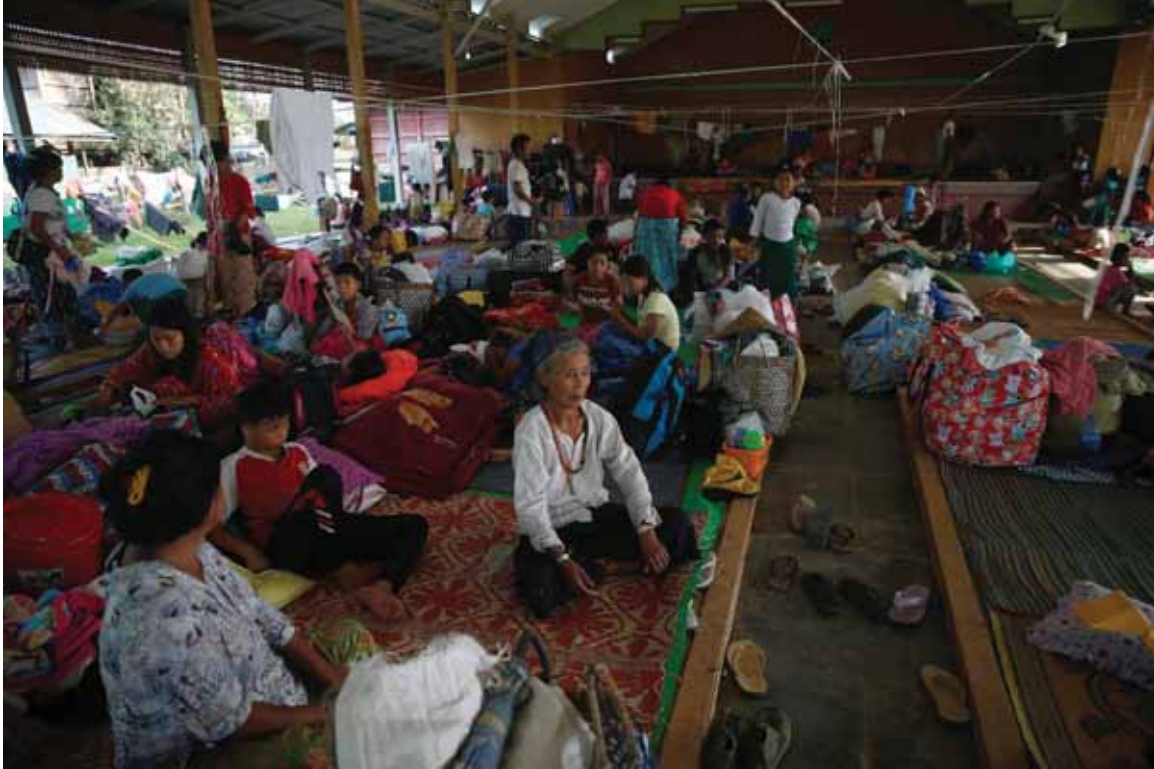
Families displaced by the conflict between the Myanmar army and the Kachin Independence Army (KIA) at a church in Tanai township, Kachin State, Myanmar, June 2017.