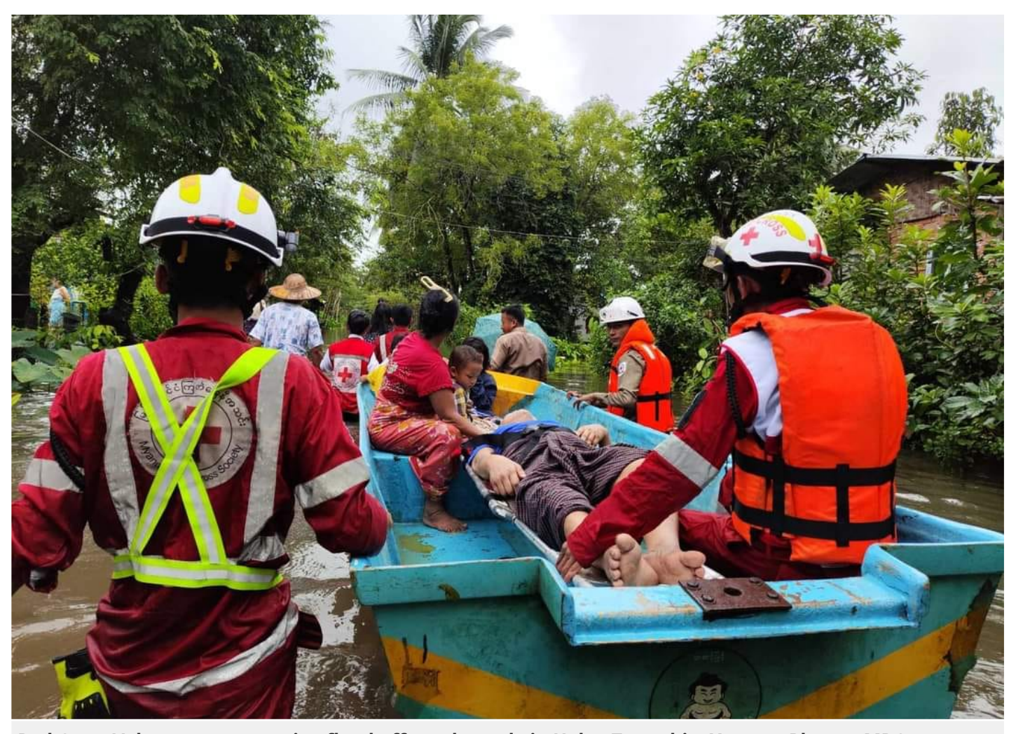
Red Cross Volunteers evacuating flood-affected people in Helgu Township, Yangon.