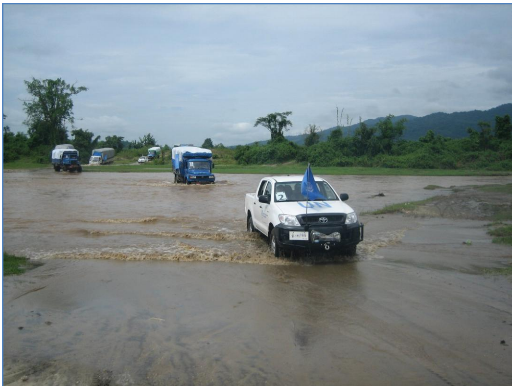
Cross-line mission to Laiza area, 23 September.

More regular and access is required to IDPs in these hard-to-reach areas, for assistance, monitoring and coordination purposes. Similarly, as access improves, additional funding support will continue to be crucial to ensure the required assistance is provided to the over 53,000 IDPs in areas beyond Government control in Kachin and Northern Shan States.