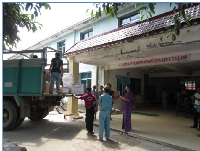
Medical supplies delivered to Laiza General Hospital on 17 September.

In the Laiza area, IDPs have free access to health care through clinics established in three camps, as well as at the Laiza General Hospital, which is within walking distance from the fourth camp. Some of the clinics need improvement, such as in Mast (3) Gat. All clinics require proper storage space for medical supplies and a systematic inventory control system. While immunisation coverage is high in certain areas (including Laiza) thanks to the support of NGOs, the coverage is unequal and many camps along the border are still lacking immunisation coverage. Vaccination for ATT (tetanus) is still needed in all camps.