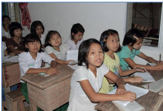
Students at the Laiza IDP boarding school, 24 September.

Government control. Students and schools require more qualified teachers, textbooks, stationery, and furniture.