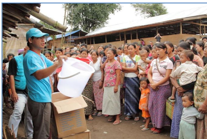
UNICEF public hygiene promotion in Laiza area, 26 September.

Additional coordination meetings – including WASH cluster and food sector meetings – were set up to increase coordination. The meetings will be organised on a monthly basis and regular information-exchange between Myitkyina-based and border-based organisations was agreed upon. More complete who-what-where (3W) information is being compiled by these sectors. Similar coordination meetings for the remaining sectors are planned as a next step.