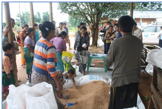
WFP food distribution at Seng Ja camp on Maija Yang area, 13 September.

The following UN agencies and INGOs participated in the September 2013 missions: WFP, UNCHR, UNICEF, UNOCHA, UNFPA, MDM, DRC, ACTED, and Solidarites International. During the missions, organisations distributed humanitarian assistance to a total of over 22,000 people. Items delivered included one-month supply of food (rice, pulses, cooking oil and salt - with variations in rations adapted to the assistance being provided by local NGOs on a regular basis), non-food items (bed nets, sanitary kits, tarpaulins and cooking utensils), hygiene kits, educational materials, water purification tablets, and medicines. Protection trainings and capacity building sessions on the development of women and child protection programmes were also organised. In addition, CCCM (Camp Coordination and Camp Management) trainings were held for staff of local organisations and camp managers. Health education sessions on personal hygiene and correct usage of health products distributed were also conducted.