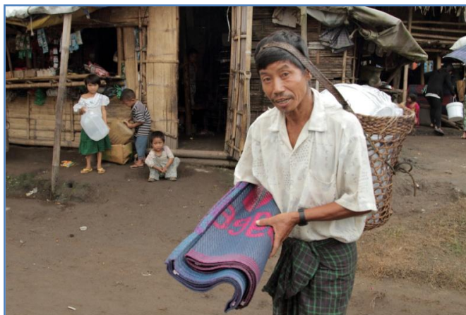
NFIs distributed in No. 3 Masat market in Laiza area , 26 September.

In the Maija Yang, the situation is similar. However, there is an additional need for firewood in the camps, as people are not able to collect firewood due to the risk of landmines.