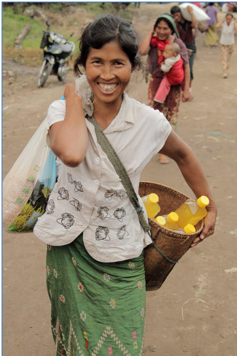
Displaced woman in Laiza area with WFP food rations, 26 September.