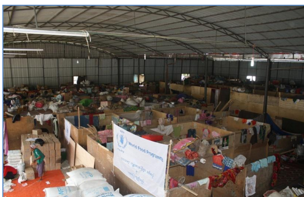
Over-crowded living conditions for IDPs in Woi Chyai in Laiza area.

In the Laiza area, no families are currently living in open spaces. However, there is an urgent need to identify new sites and provide family units to 170 IDPs households who are currently staying in over-crowded communal buildings in two camps (Woi Chyai and No. 3 Market) with very limited space and lack of privacy.