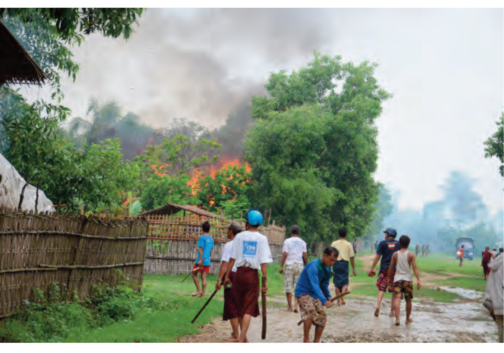
A group of Arakanese with weapons approach a Muslim village already in flames. Sittwe Township, Arakan State, June 2012.