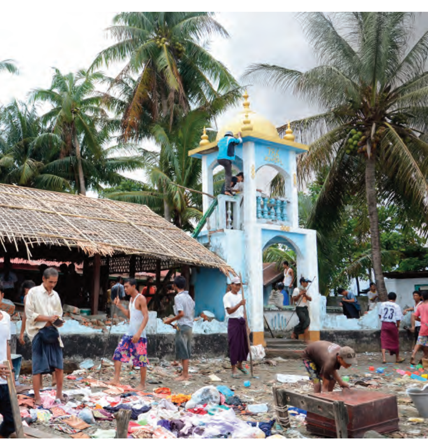
Local Arakanese dismantle and loot the site of a destroyed mosque in Sittwe, June 2012.