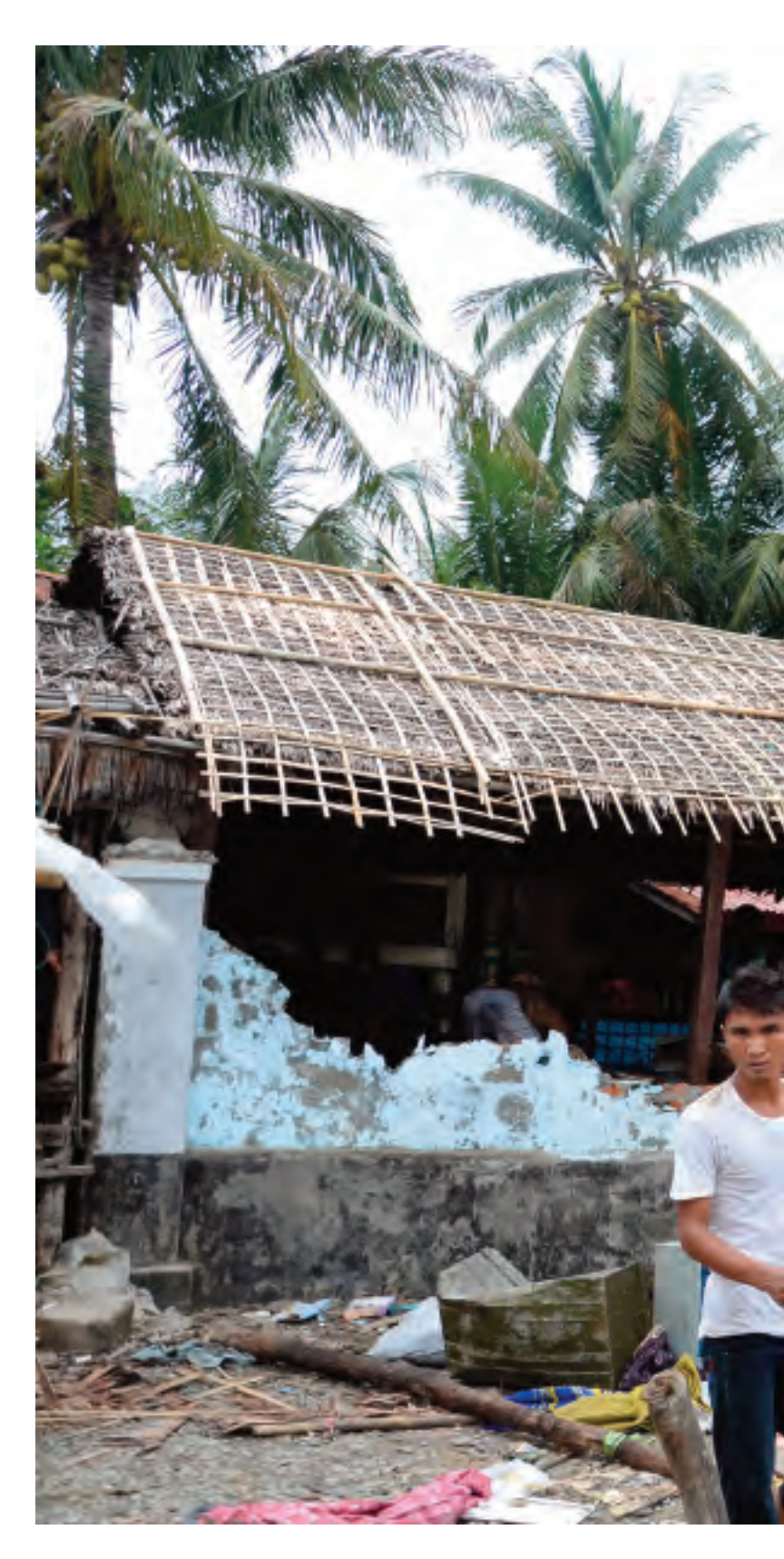
violence that were widespread, systematic, and directed at the Muslim population. The many public statements and

Crimes against humanity included killings, forcible population transfers and deportation, persecution, and other