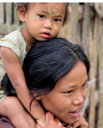
Young mother with child in the Ayeyarwady Delta, © SDC

situations through partners such as the World Food Programme (WFP).