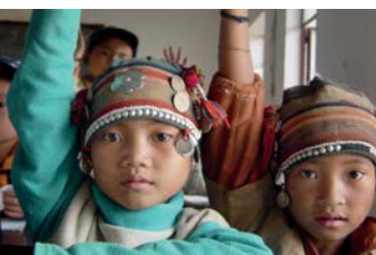
School feeding beneficiaries, Wa Special Region