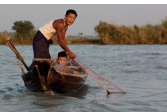
Fisherman in the Ayeyarwady Delta