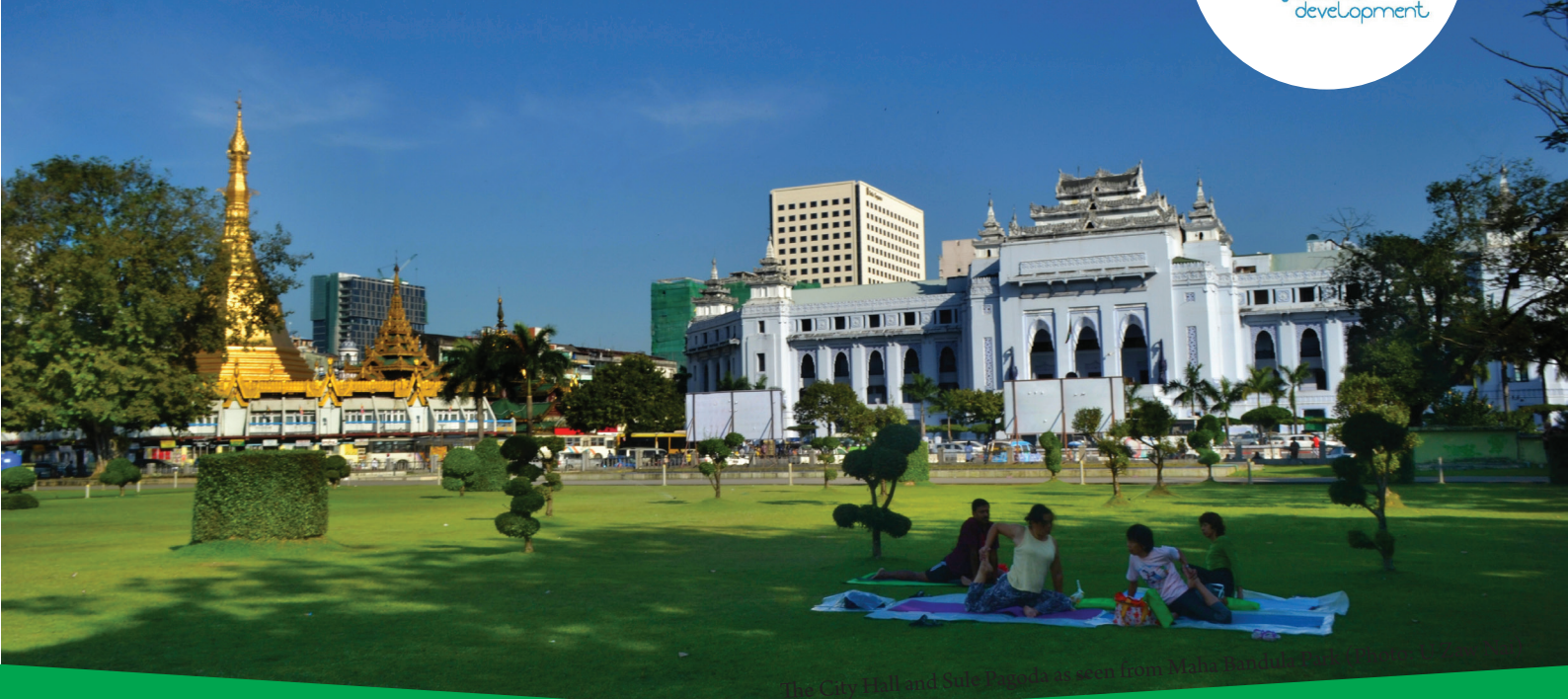
The City Hall and Sudagun as seen from Maha Bandula Park