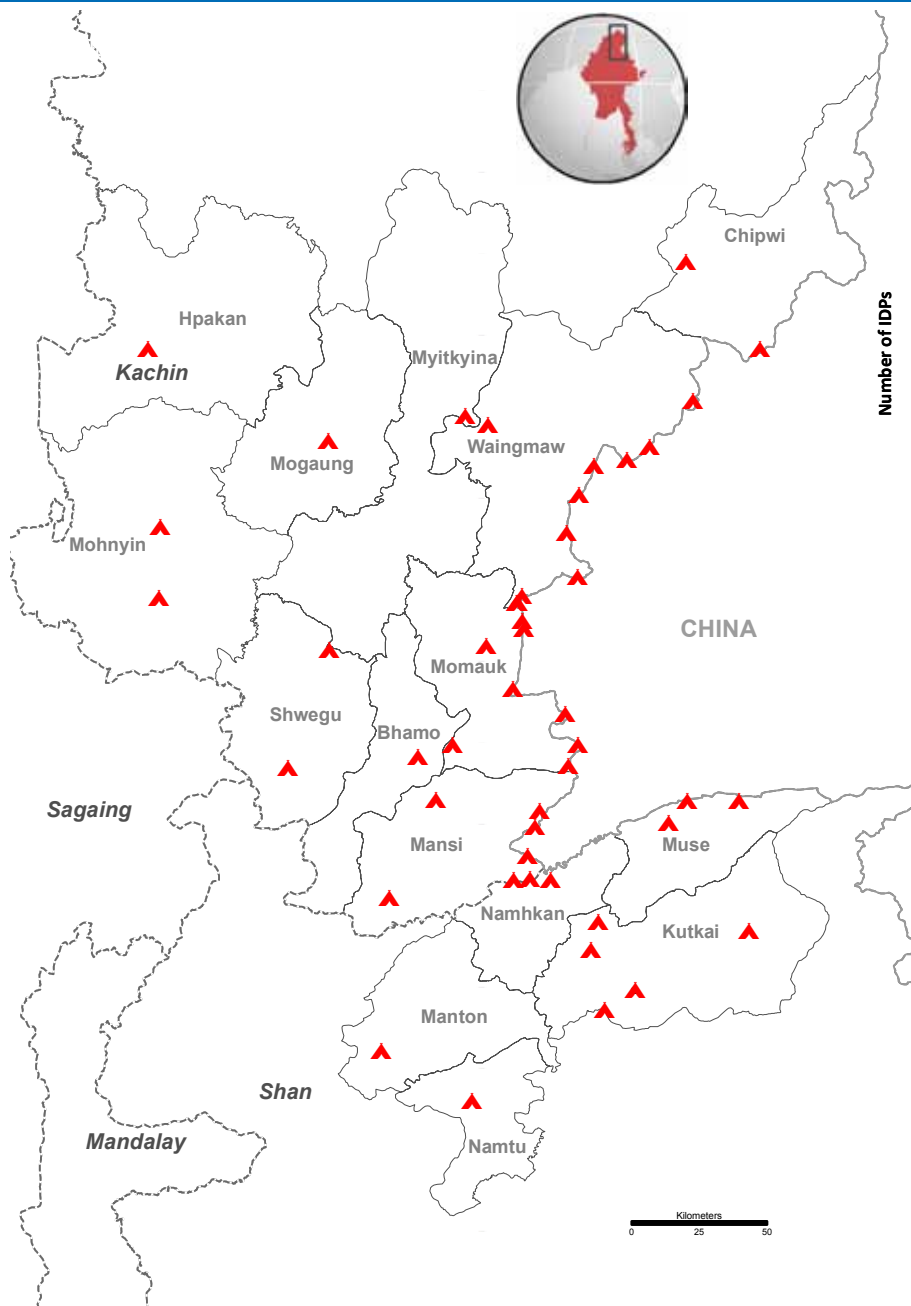
IDP figures 2012/2013

While awaiting permission from the Government for resumption of cross line mission, humanitarian partners are continuing their response in all accessible locations. Access restrictions have resulted in a significant variation in quality and quantity of assistance provided to those within Government areas, as compared to those beyond. Some camps particularly in remote border areas remain beyond the regular reach of even local partners and have received very limited assistance. With the onset of the rainy season, immediate resumption of independent cross line operation is crucial to deliver much needed assistance to all affected locations.