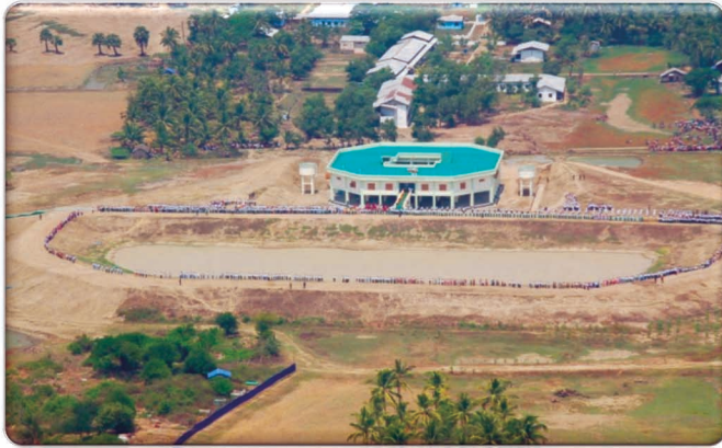
Cyclone Resilient School-cum-shelter from Cyclone affected area