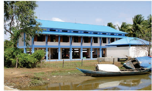
Primary School-cum-Shelter in Aung Hlaing, South Pyapon