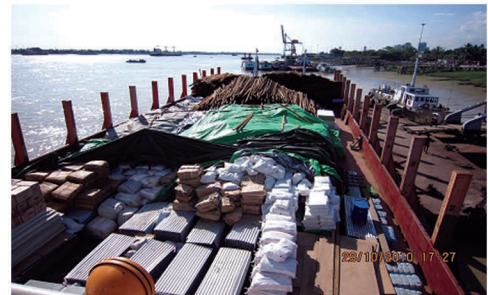
Loading up Relief items and Construction Materials to Giri affected areas