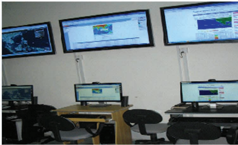
Situation Monitoring in EOC