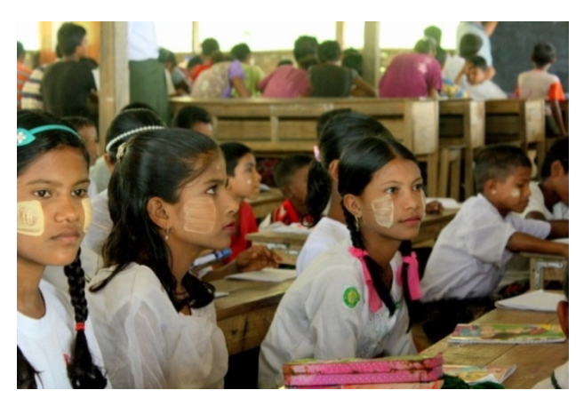
Credit: OCHA Rakhine State (August 2016) - A temporary learning space for children in Baw Du Pha II IDP camp in rural Sittwe.

The 2016 Humanitarian Response Plan ended the year 55 per cent funded with more than $104 million received towards the $190 million requested. Despite significant needs, some sectors were very poorly funded. The sectors that received the least donor support were education (14 per cent) and health (13 per cent). In 2017, more than 140,000 children are estimated to be in need of education support and $7.1 million is requested through the