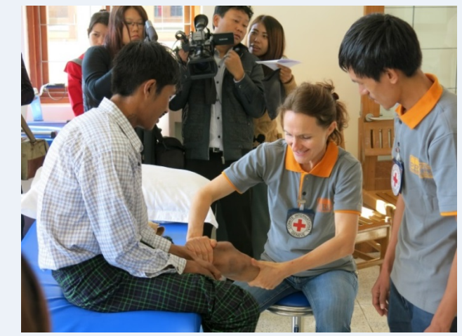
Kachin State (November 2016) - A client being assessed before being fitted with a prosthetic at the new physical rehabilitation centre in Mytkyina.

The facility was recently handed over to the Ministry of Health and Sports and is the second biggest ICRC-supported physical rehabilitation centre in the world in terms of working surface area, after the centre in Kabul, Afghanistan.