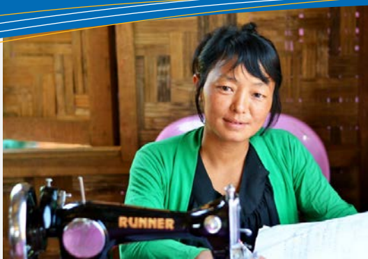
A displaced woman in Kachin, March 2015.

total humanitarian funding received for Myanmar