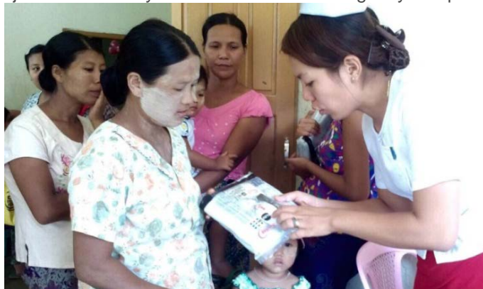
A midwife explains the contents of a Clean Delivery Kit at a clinic in Kale town, Sagaing.

From September 2015 to February 2016, UNFPA and its partners the Myanmar Medical Association, Marie Stopes International and Malteser, are supporting health authorities with a programme to provide basic life-saving medical and reproductive healthcare to people affected by floods in Myanmar's Magway and Sagaing regions and Rakhine State. These were three of the areas worst affected by the recent floods and Cyclone Komen in July and August 2015. The project is funded by the UN's Central Emergency Response Fund (CERF), which in total provided $10.4 million to jump start critical aid programmes in Myanmar for people in the worst affected states and regions, providing food, emergency healthcare, water and sanitation, shelter and protection services. The UNFPA project received approximately $380,000 in CERF funding.