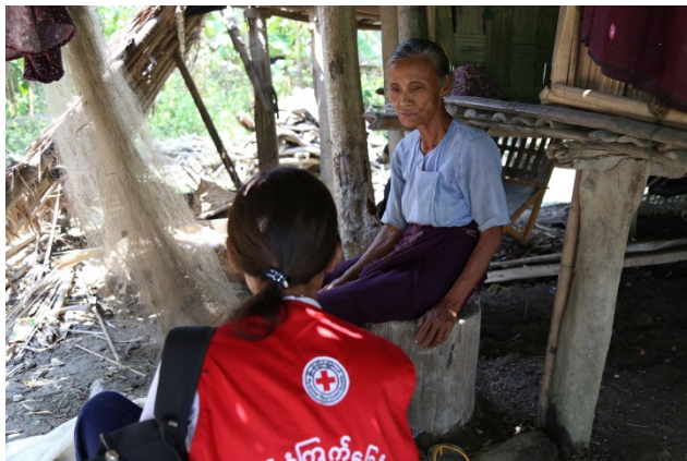
An elderly woman close to Mrauk-U explains that her family lost their fishing nets in the floods.

To help vulnerable families recover, ICRC and MRCS also provided cash for work opportunities to almost 2,500 labourers, as well as conditional cash grants to some 3,300 fishing and farming families and day labourers in 10 village tracts in Mrauk-U and Minbya townships from October to December. The conditional cash grants of 180,000 MMK (approximately $137) were provided to help families restart their livelihoods by buying winter-crop seeds for replanting or livestock to replace animals that perished in the floods or to replace boats and fishing nets lost during the floods. Cash for work activities, including clearing roads, renovating bridges, fencing of ponds, helped participants increase their monthly income.