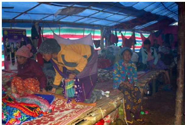
IDPs in Moghsu, southern Shan State, Dec. 2015.

The majority of the 6,000 people displaced in Southern Shan in October as a result of fighting returned to their homes in late November and December after the fighting stopped. However, close to 2,000 people remained displaced in Kyethi and Monghsu townships at the end of December. Some attempted to return but reported that they were unable to do so given the continued presence of troops in the area and continued movements of armed State and non-State actors in and around their villages of origin. Landmines in villages of origin are also a concern, according to local organizations.