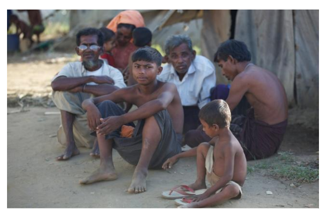
Thea Chaung camp, Rakhine, Nov 2012.

In November, Save the Children published а report outlining recommendations for the sector based on the education needs and perceptions of Rakhine and Muslim IDPs and host communities in Sittwe and Pauk Taw. Key findings confirmed the high value placed on education by both communities and the wish by Muslim IDPs to see education services expanded, particularly for vulnerable postprimary and youth age group for whom there is currently huge underprovision (only 7 per cent coverage).