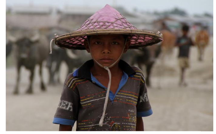
A child in Set Yoe Kva IDP camp. Rakhine.

International organisations in Rakhine State are increasing their outreach work with local community leaders and civil society groups to promote dialogue and improve the understanding of the humanitarian response and development projects across the State. This is part of a broader effort to address the complex underlying root