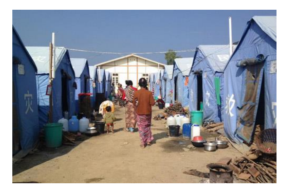
The Tedim camp in Chin state, hosting communities who remain unable to return home after the 2015 floods.

Humanitarian organizations in Myanmar have been working to increase the resilience of communities where women and children are vulnerable and face protection risks due to annual flooding. After Cyclone Komen caused flooding and landslides across the country in 2015, many reports of gender-based violence (GBV) were received but the Department