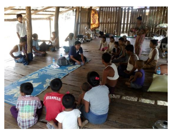
An OCHA Assessment with IDPs at Auk Pyin Nyar Primary School, Kyauktaw, Rakhine on April 2016.

Myanmar Military and the Arakan Army near Wa-Ngwe village in Kyauktaw Township and near Nattha-Ywe village in Rathedaung Township in the northern part of Rakhine State. The Rakhine State Government has provided cash to the 395 affected families and humanitarian organizations have delivered other relief. Returns are dependent upon security in people's villages of origin. The State Government has agreed that suitable locations for longer-term shelter will be identified if displaced people feel unsafe returning home. Elsewhere in Rakhine, about 120,000 IDPs remain in camps, the majority of whom are Muslims who identify themselves as Rohingya.