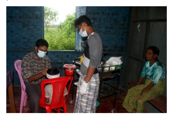
Mobile clinics provide basic care to IDPs in camps in Rakhine but serious conditions often involve expensive travel to Sittwe.

As well as requiring a medical referral letter from health authorities, these boat trips to Sittwe are expensive, slow and dangerous in bad weather, presenting a grave risk to patients. After her recent visit to Rakhine, the Special Rapporteur, Yanghee Lee, called